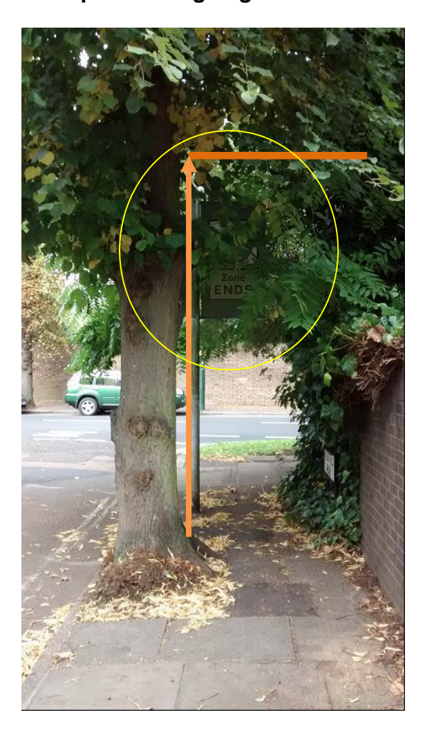
lift to 3.5m