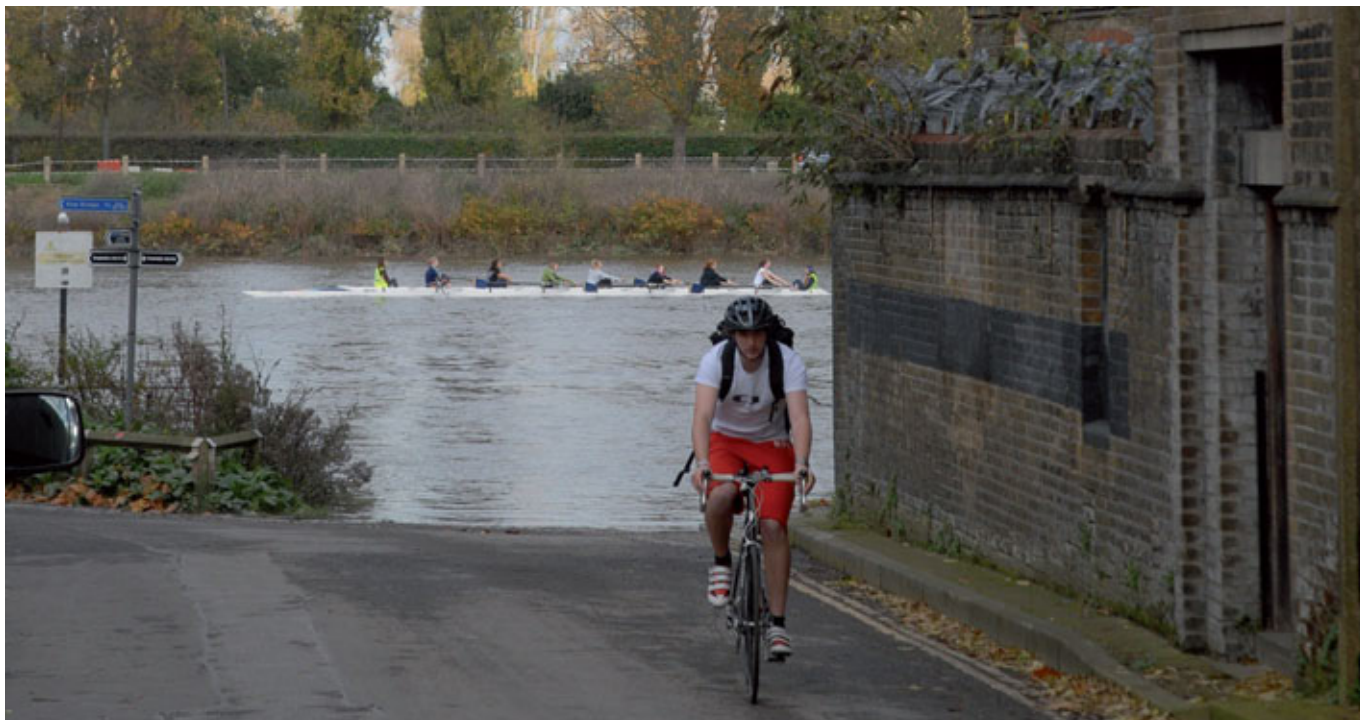
View of the river from Ship Lane

5.48 A detailed flood risk assessment would need to be undertaken as part of any planning application for the development of the site.