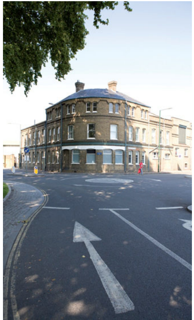
Junction of Mortlake High Street and Sheen Lane

2.11 The Maltings building sits at the junction of Ship Lane and the Thames towpath. It was built in c1902 and comprises an eight and nine storey building constructed on a rectangular footprint in London stock brick, parallel to the towpath and the River Thames. The interior of the building