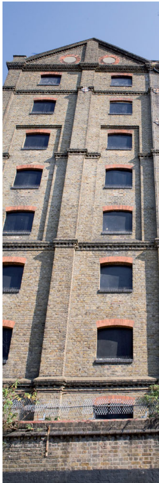
New life to be given to redundant building