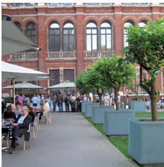
Pavement cafes and outdoor seating can add to the vitality

In accordance with the vision, the Council are seeking an eclectic mix of uses across the whole site but particularly related to the new green space, the Maltings and along the Riverside and Mortlake High Street. CP 19, DM TC2 and DM DC2 apply. The Land Use plan included in this document is illustrative and although it highlights areas for various uses this is not intended as a zonal planning