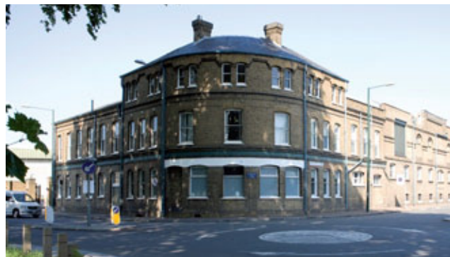
Existing building to be integrated

views of the River. A key element of the Council's vision is to create an open space link between Mortlake Green and the River (which could include sympathetic treatment of any crossing/links across Lower Mortlake Road), a Waterside Open Space close to the Maltings and an amenity area along the Riverside near to Bulls Alley. It is envisaged that new green space could provide leisure opportunities to meet local needs such as a temporary ice rink, fairground and market. The vision is also based on buildings around the green being of a design and scale as to promote a village green atmosphere with traditional architecture sensitive local vernacular and a mix of uses to promote a vibrant and inspiring area. The use of green infrastructure and multi functional open spaces should be considered as