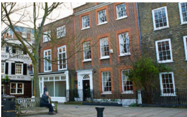
Architecture should reflect historic character

5.29 The Council’s adopted Supplementary Planning Guidance, Mortlake Conservation Area (Study) and