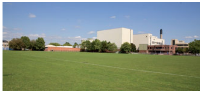
Private playing fields with brewery buildings beyond

Consideration has been given to whether there would be any benefits from the relocation of this space and the Council’s conclusion (supported by the public) is that it must be retained in this location, and made more accessible for public use.