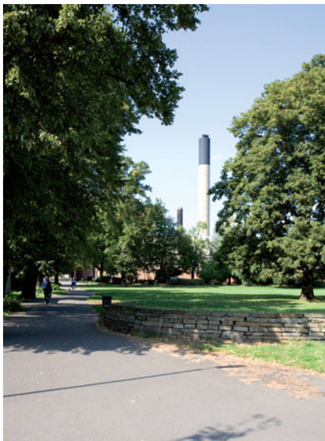
Site viewed through Mortlake Green

2.27 The existing site is currently in employment use and all the buildings on the site are associated with the existing use of the site as a brewery. Retention of brewery use on the site in its current