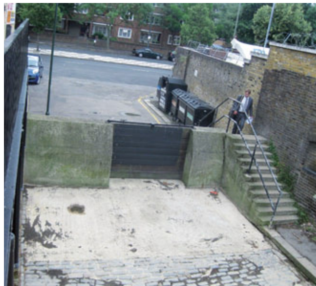
Flood defence measures dominate Bulls Alley

2.47 The opportunity to integrate with the Thames Policy Area must be considered and the Council will seek to protect and enhance the special character of the Thames Policy Area.