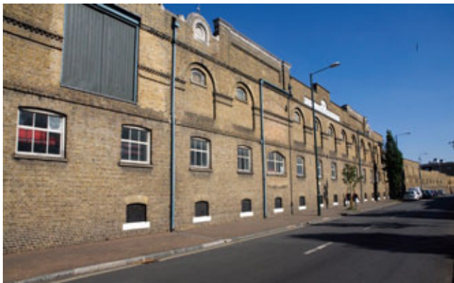
Existing southern boundary facing Mortlake High Street