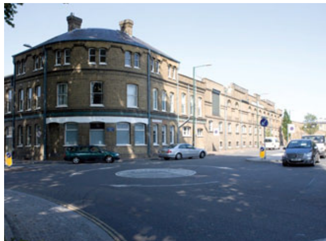
Traffic dominates Mortlake Green/Sheen Lane

Street and the River Thames. It is envisaged that the imaginative use and partial removal of these structures, allowing access and views from the site to the Thames path and the High Street, and the inclusion of active uses and frontages in these locations would deliver substantial public benefits. This will need to be considered in the context of the northern boundary structure as a flood defence.