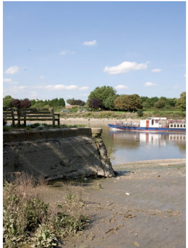
Exposed riverbank at low tide

form is considered to be unviable in the long-term by Inbev due to the space constraints that limit the scope for consolidation of operations.