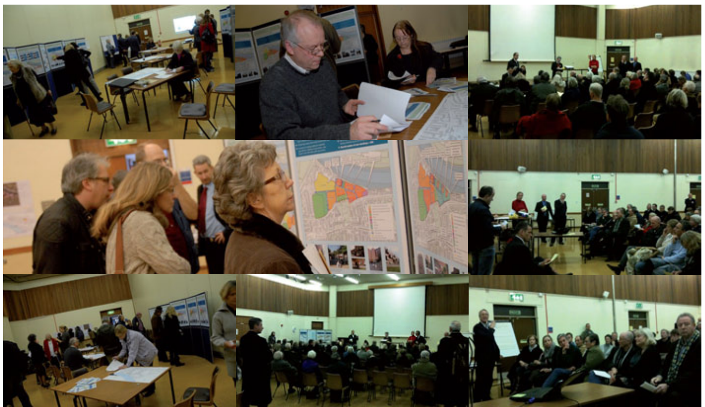
Consultation in December 2009