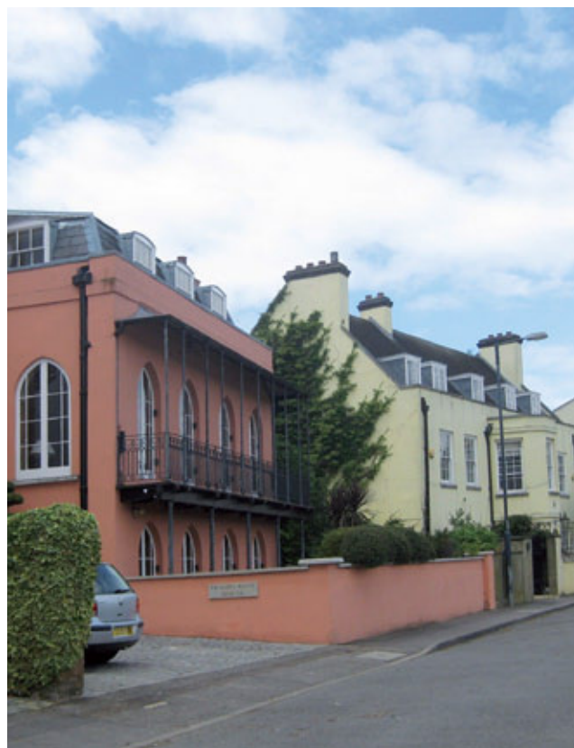
Existing character of the area must be respected

of buildings of townscape merit on the Lower Richmond Road.