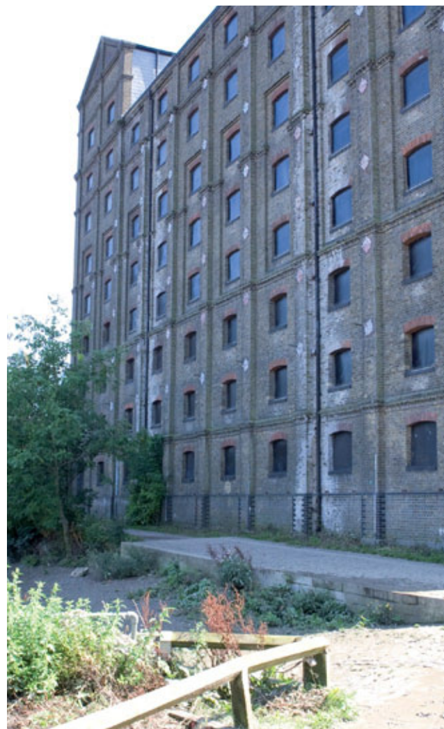
Former Maltings Building

2.14 This fronts the High Street and was constructed in c1869. The building is no longer used for bottling but parts are used for storage. It is built from London stock brick and rises to three storeys. There is a rendered area on the south elevation which reads “1869 Mortlake Brewery”. The building retains cast iron columns and basement ground and first floor which hold up arched painted brick ceilings.