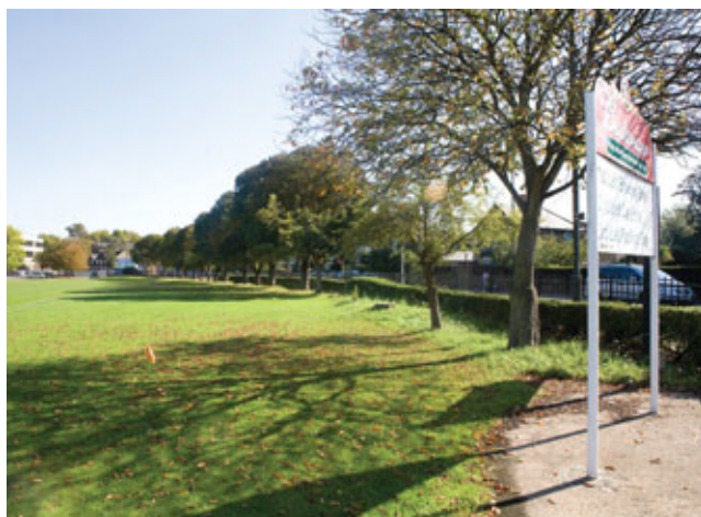
Mature trees edge Lower Richmond Road

2.36 It is recognised that the northern and southern boundary structures to the eastern sections of the site prevent permeability between Mortlake High