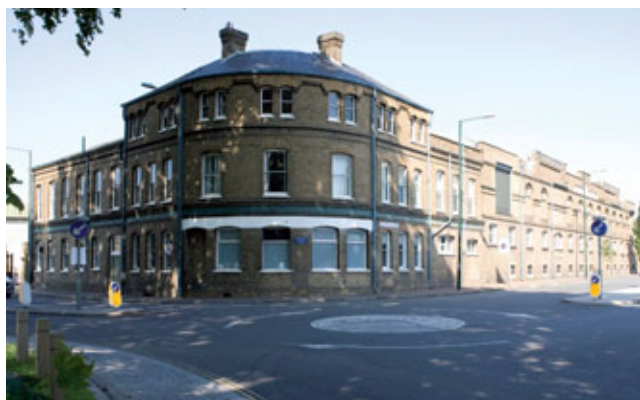
Former hotel building facing Mortlake Green

2.18 The boundary to the north comprises five different sections and separates the brewery site and the public towpath. The boundary structure to the