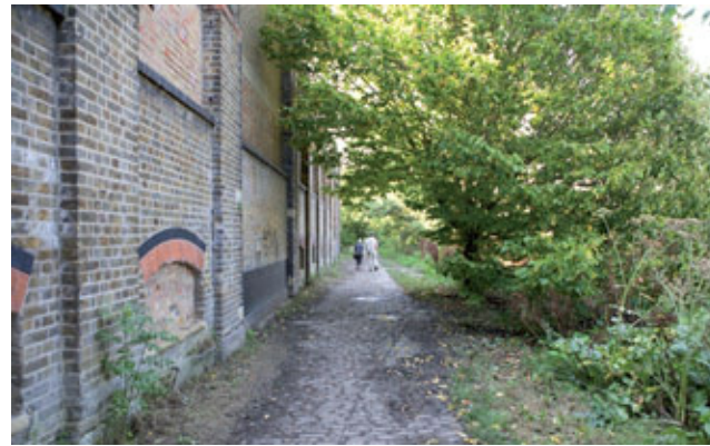
Existing northern boundary facing Thames