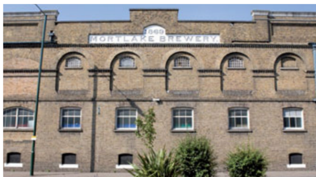
Former bottling building facing Mortlake High Street