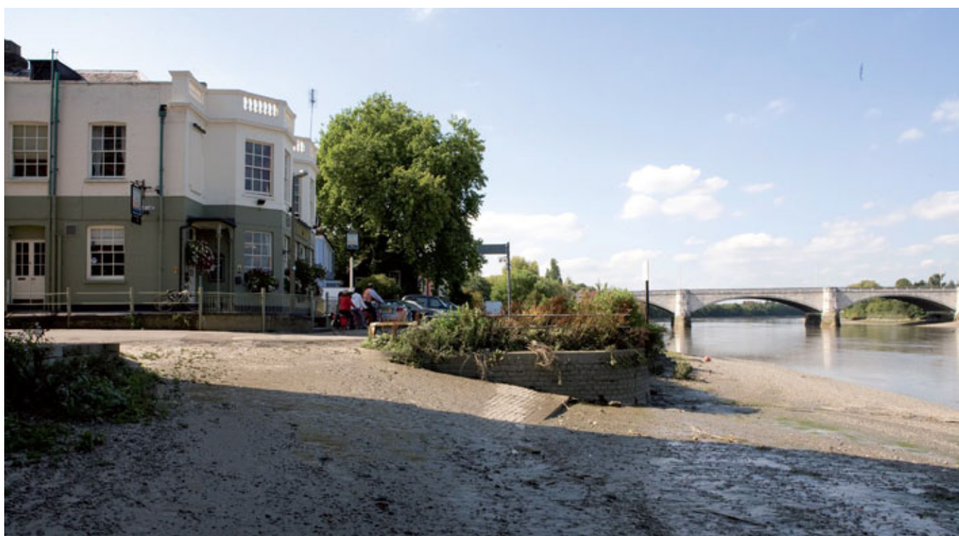
Exposed riverbank with site to the left