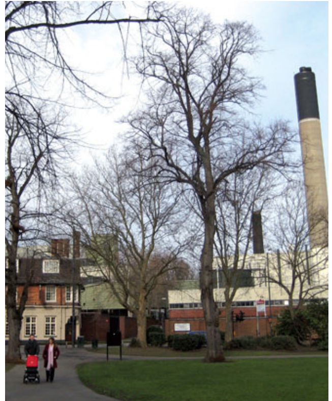
View from Mortlake Green

1.20 As an SPD, the Brief aims to provide guidelines as to the future uses for the site. The Brief sets out the site's opportunities and constraints and will be a material consideration in determining any applications for planning permission.