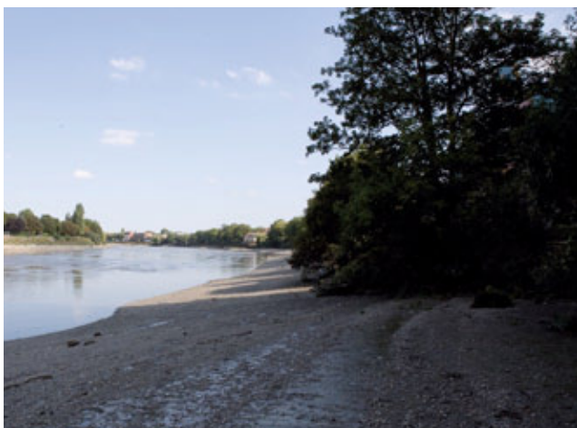
View towards Thames with site to the right

2.3 The site occupies a long, roughly triangular-shaped site to the west of Mortlake Town Centre. The northern boundary is bounded by the south bank of the River Thames, with the High Street and Lower Richmond Road to the south and William's Lane to the west.