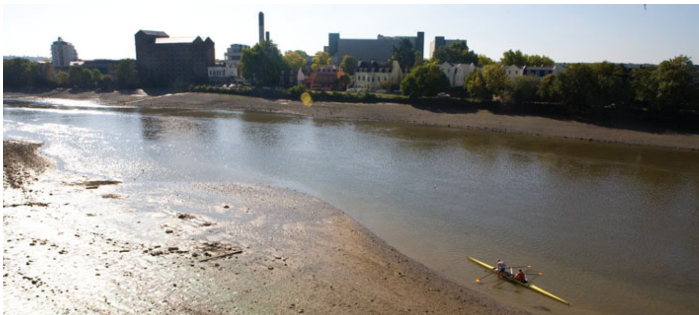
The site viewed from the Thames with brewery building and riverside villas to the river front

provide the centre piece of a new community hub as well as a high quality open public realm and landscape with open access to the river as well as maximising the considerable assets and history of the area. Opportunities should be taken to enhance biodiversity throughout the site and particularly along the River.