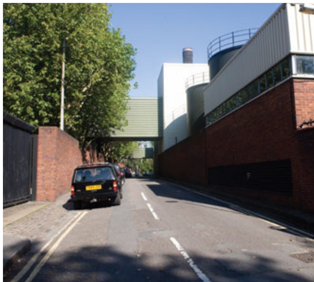
Mature trees on Ship Lane and blank boundary walls