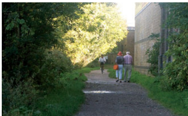
Informal self seeded landscape along riverside

2.43 This is designated as “Other Open Land of Townscape Importance” (DM OS3) which the Council will seek to protect and enhance.