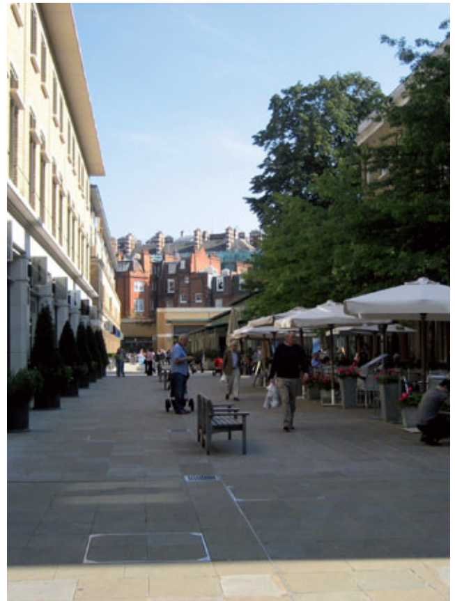
Activity generating uses prioritised at street level

5.14 Such uses could provide vitality and viability and encourage more activity particularly adjacent to the river. These uses also create an opportunity to re-invigorate the High Street, combined with landscape treatment to improve and reduce the dominance of the existing dual-carriageway environment. It is suggested that small convenience shops could be located on the Lower Richmond Road to benefit from passing trade; any more specialist shops/studios would be around the Riverside Square. These would be small scale retail uses and should not compete with East Sheen District or lead to an unacceptable impact on other local shopping centres and parades in accordance CP8 and DM TC2. The area is not to be considered as a retail