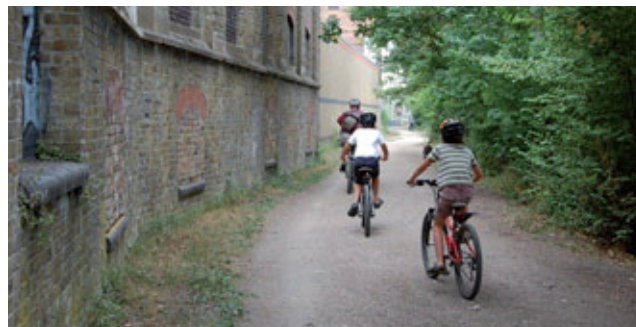
Pedestrian route between the site and the Thames