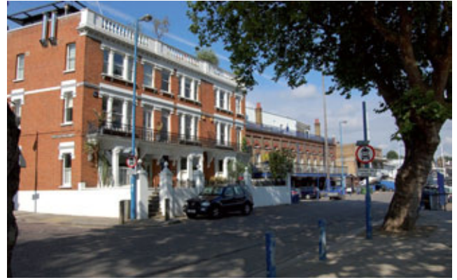
Well proportioned and sensitive architecture is required

The integration of these buildings with the development of the site will need to be carefully considered with special attention paid to preserving their setting and preserving or enhancing the character or appearance of the Conservation Area. The retention of the northern and southern boundary structure may prevent key public benefits from being realised. In particular, the