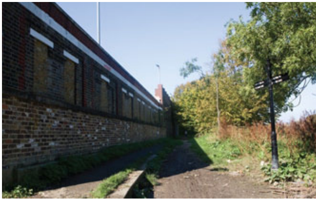
Existing northern boundary facing Thames