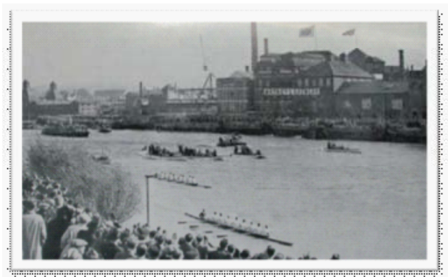
University Boat Race 1937