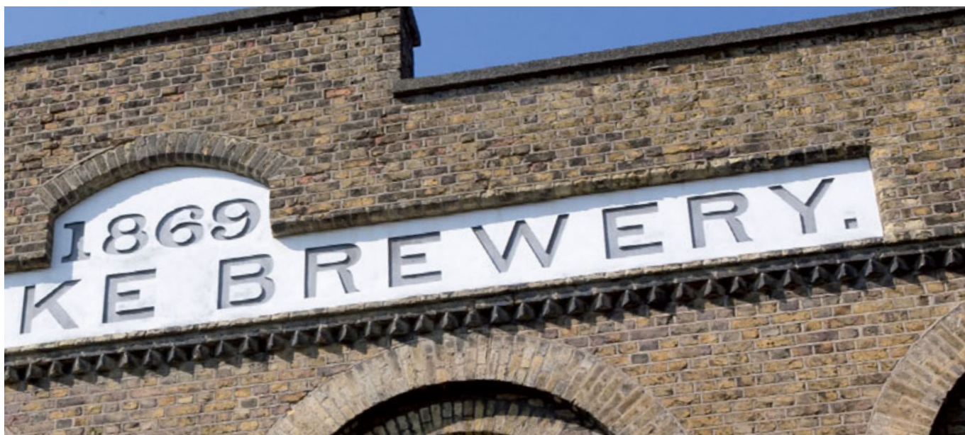
Facia of former bottling building

4.6 The key aspects of the vision are that a scheme should;