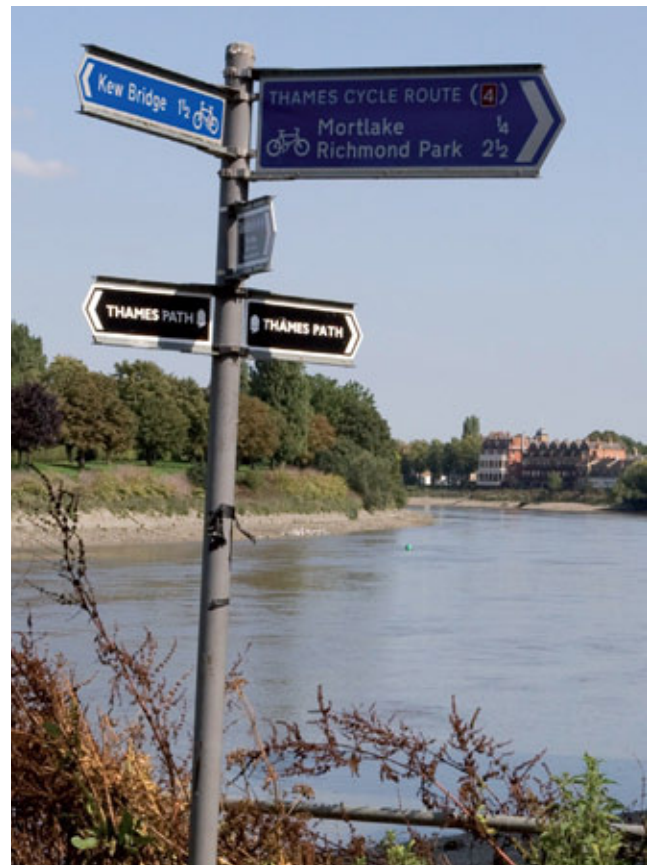
View towards Thames Path with site behind