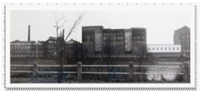
View from north side of the Thames 1972