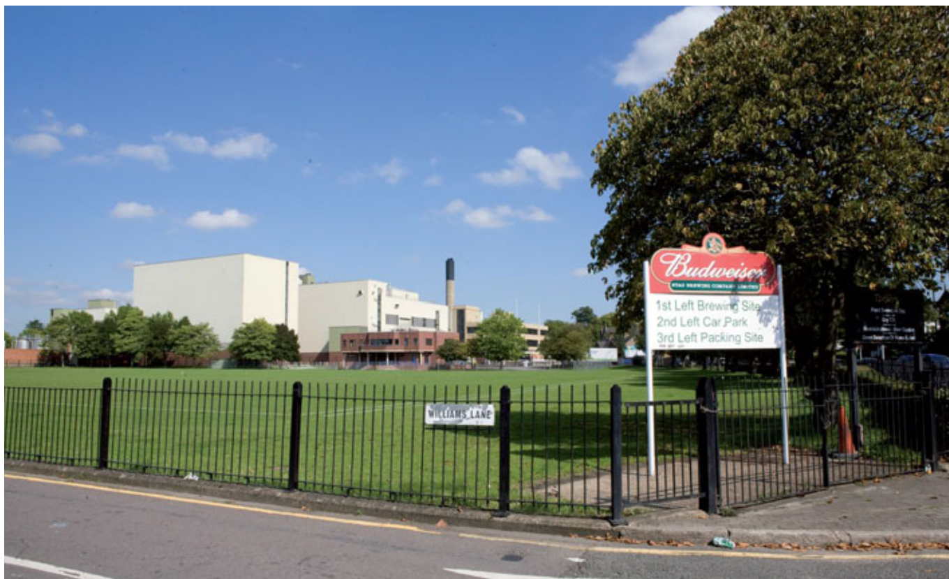
Existing playing fields

views of the River. A key element of the Council's vision is to create an open space link between Mortlake Green and the River (which could include sympathetic treatment of any crossing/links across Lower Mortlake Road), a Waterside Open Space close to the Maltings and an amenity area along the Riverside near to Bulls Alley. It is envisaged that new green space could provide leisure opportunities to meet local needs such as a temporary ice rink, fairground and market. The vision is also based on buildings around the green being of a design and scale as to promote a village green atmosphere with traditional architecture sensitive local vernacular and a mix of uses to promote a vibrant and inspiring area. The use of green infrastructure and multi functional open spaces should be considered as