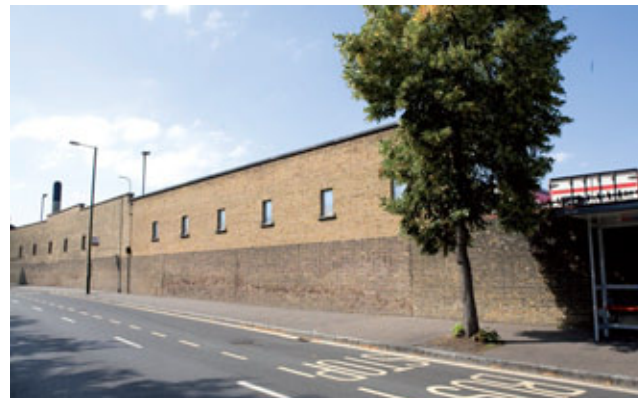
Existing southern boundary facing Mortlake High Street

east nearest Bulls Alley, where it survives in the form of historic brickwork, is mostly formed from the surviving river facing elevations of the old brewery buildings, now demolished.