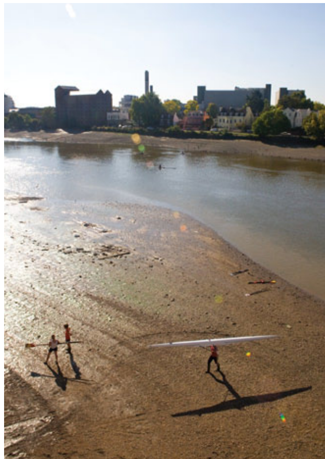
View of the site from the opposite bank