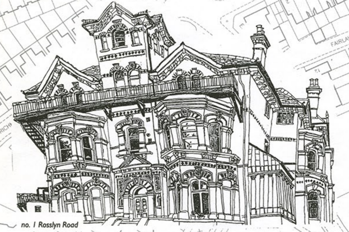
no. 1 Rosslyn Road