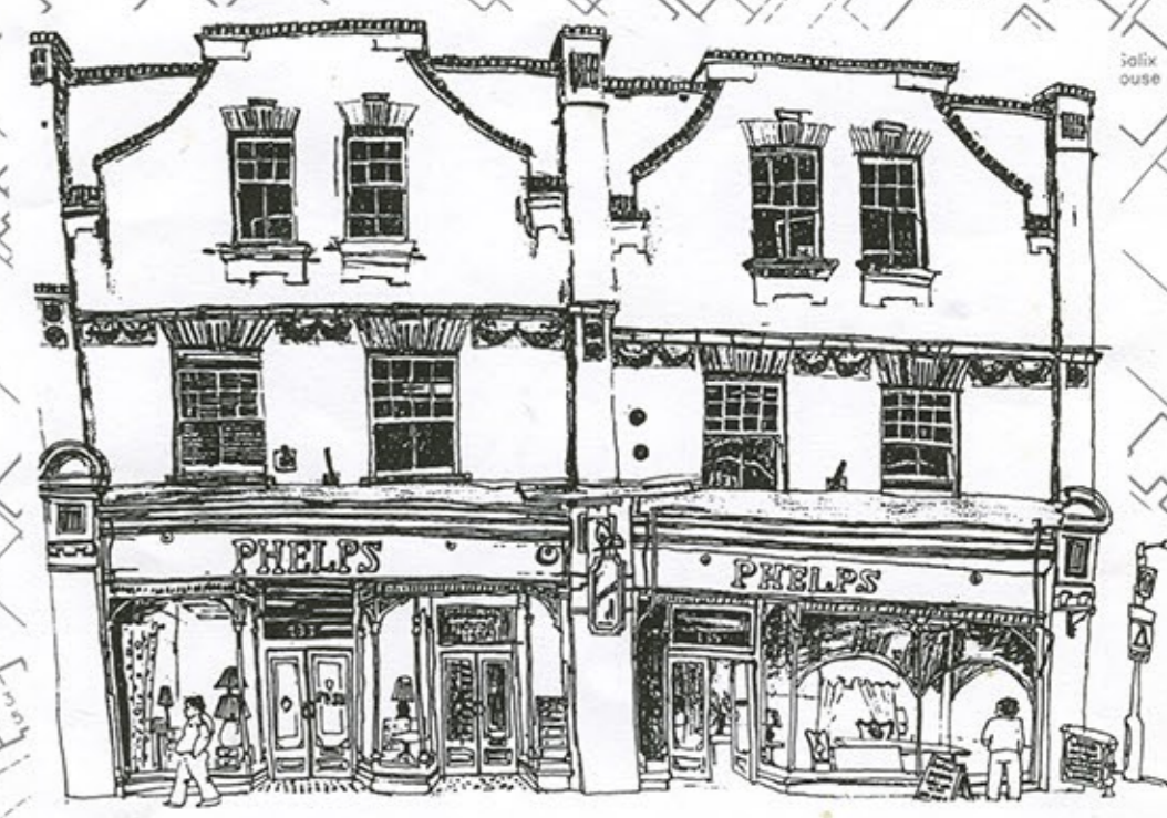
nos. 133-135(odd) St. Margaret's Road