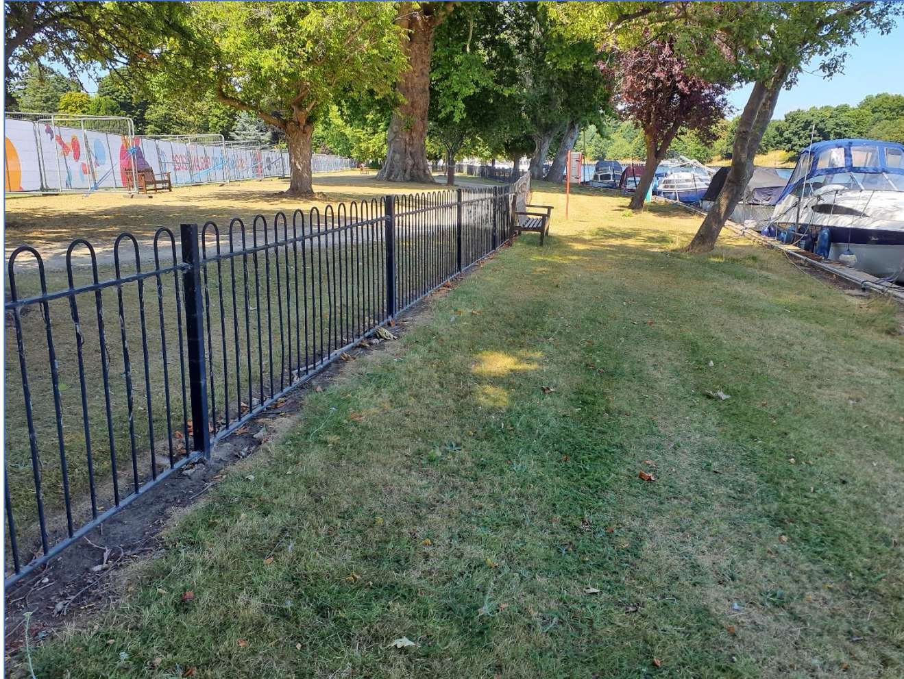
Figure 4: Lensbury Club Grounds - degraded acid grassland