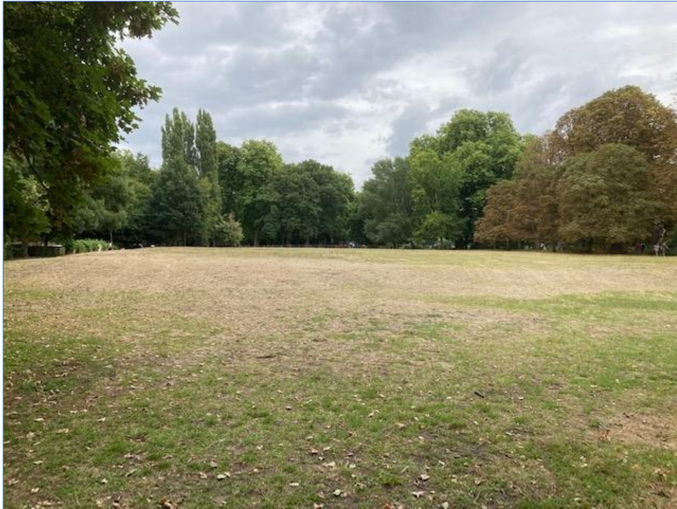
Figure 18: Orleans Gardens