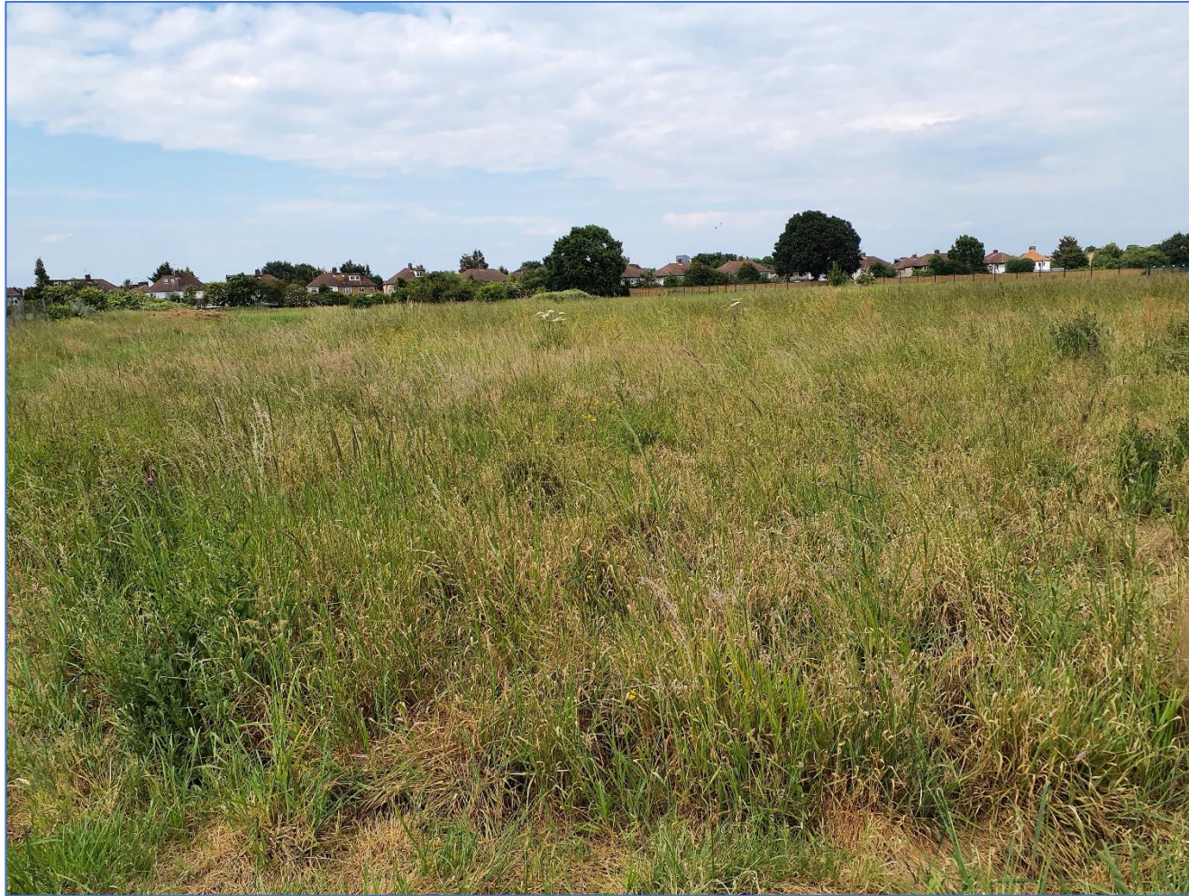
Figure 16: Jubilee Meadow - extensive semi-improved neutral grassland