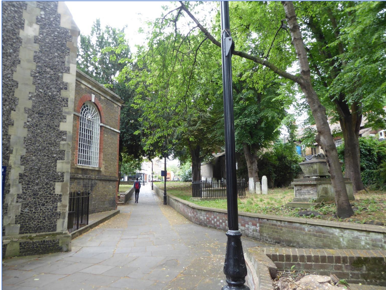
Figure 21: St Mary Magdalen Churchyard (Richmond)