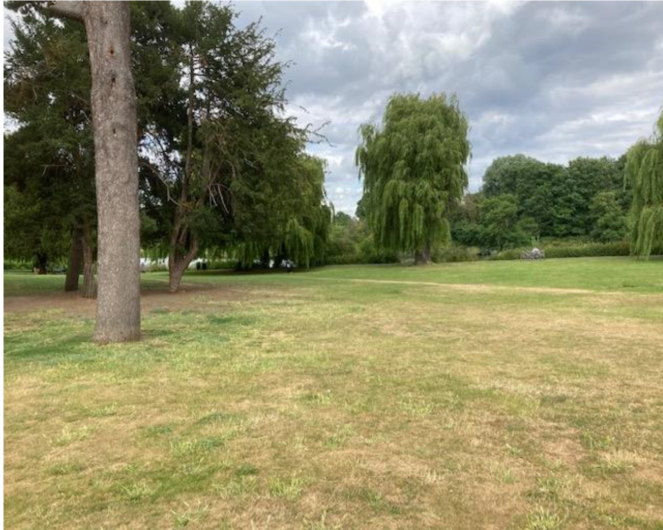
Figure 31: Radnor Gardens