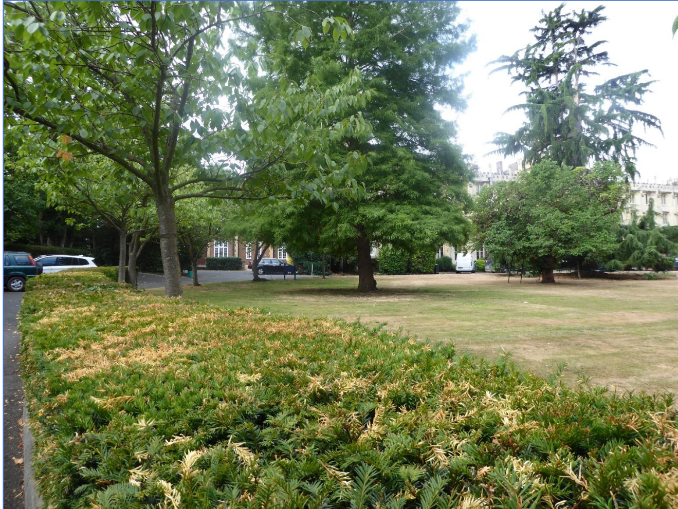
Figure 6: American University