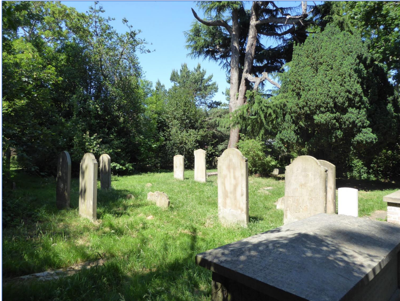
Figure 9: Oak Lane Cemetery