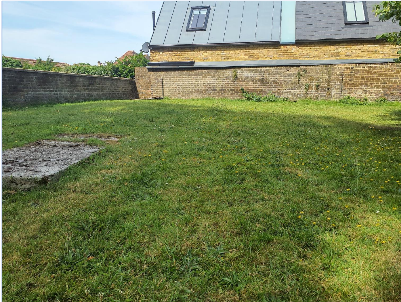
Figure 34: St Mary's Parish Church (Hampton) - Semi-improved neutral grassland