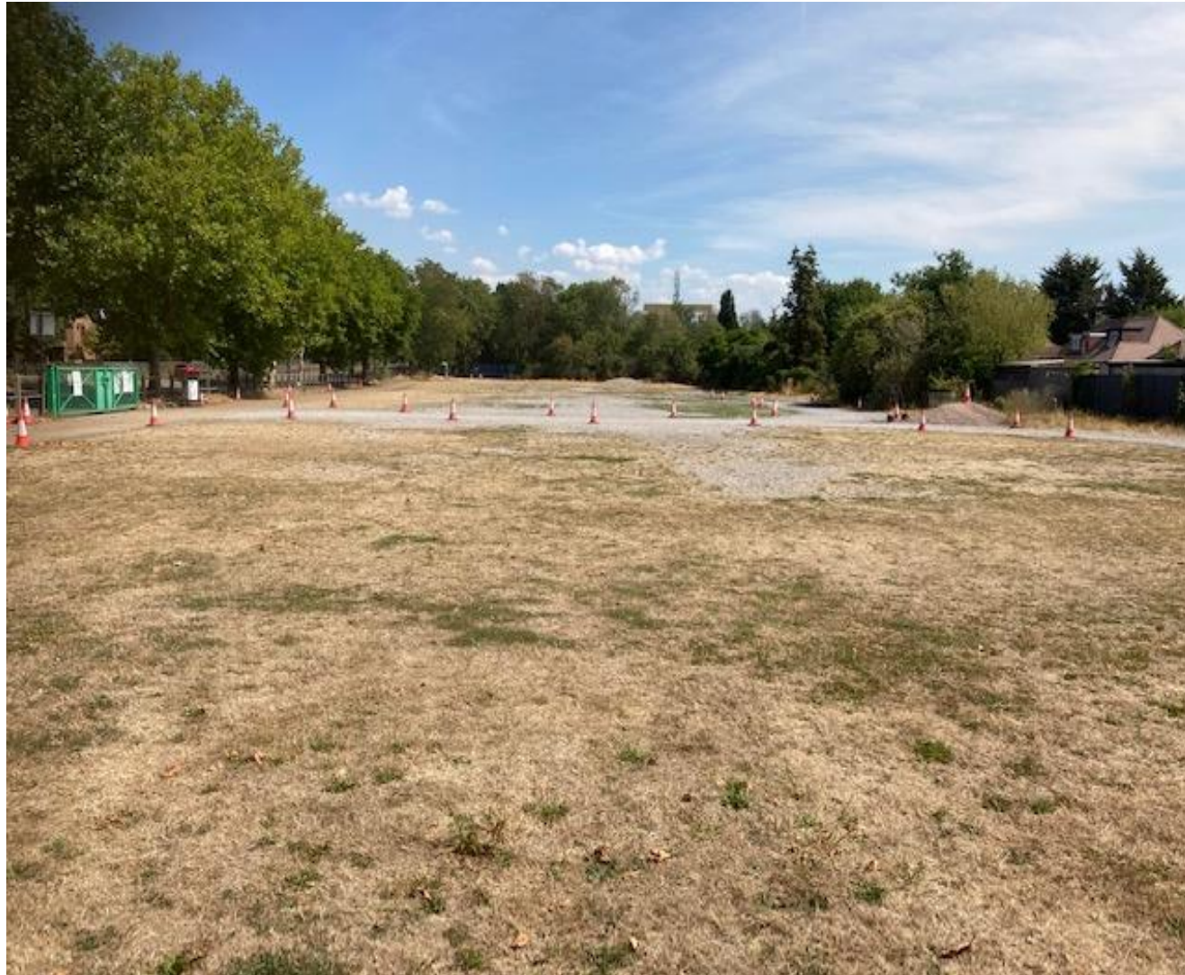
Figure 25: Chertsey Road Meadow