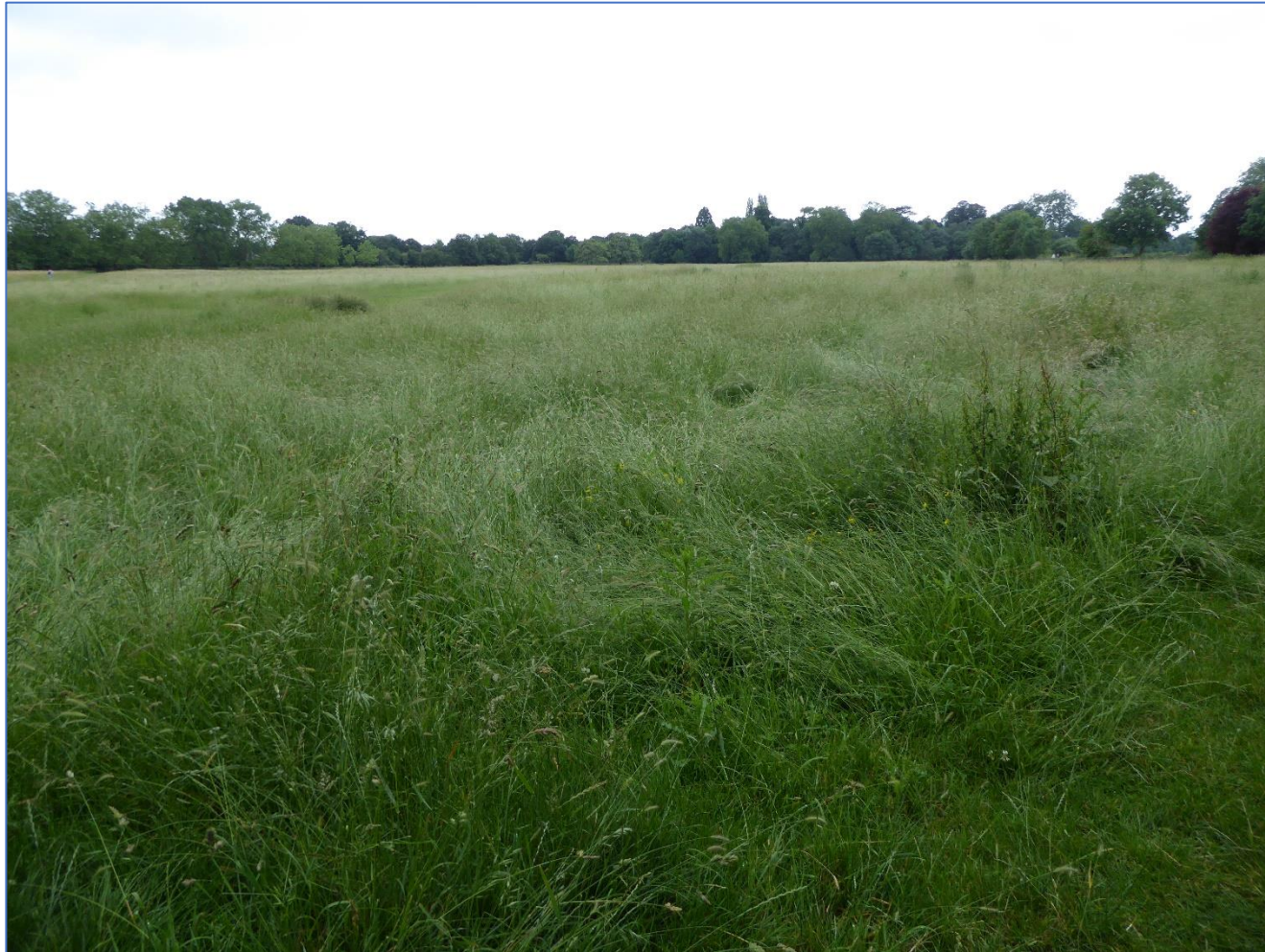
Figure 37: Udney Hall Gardens