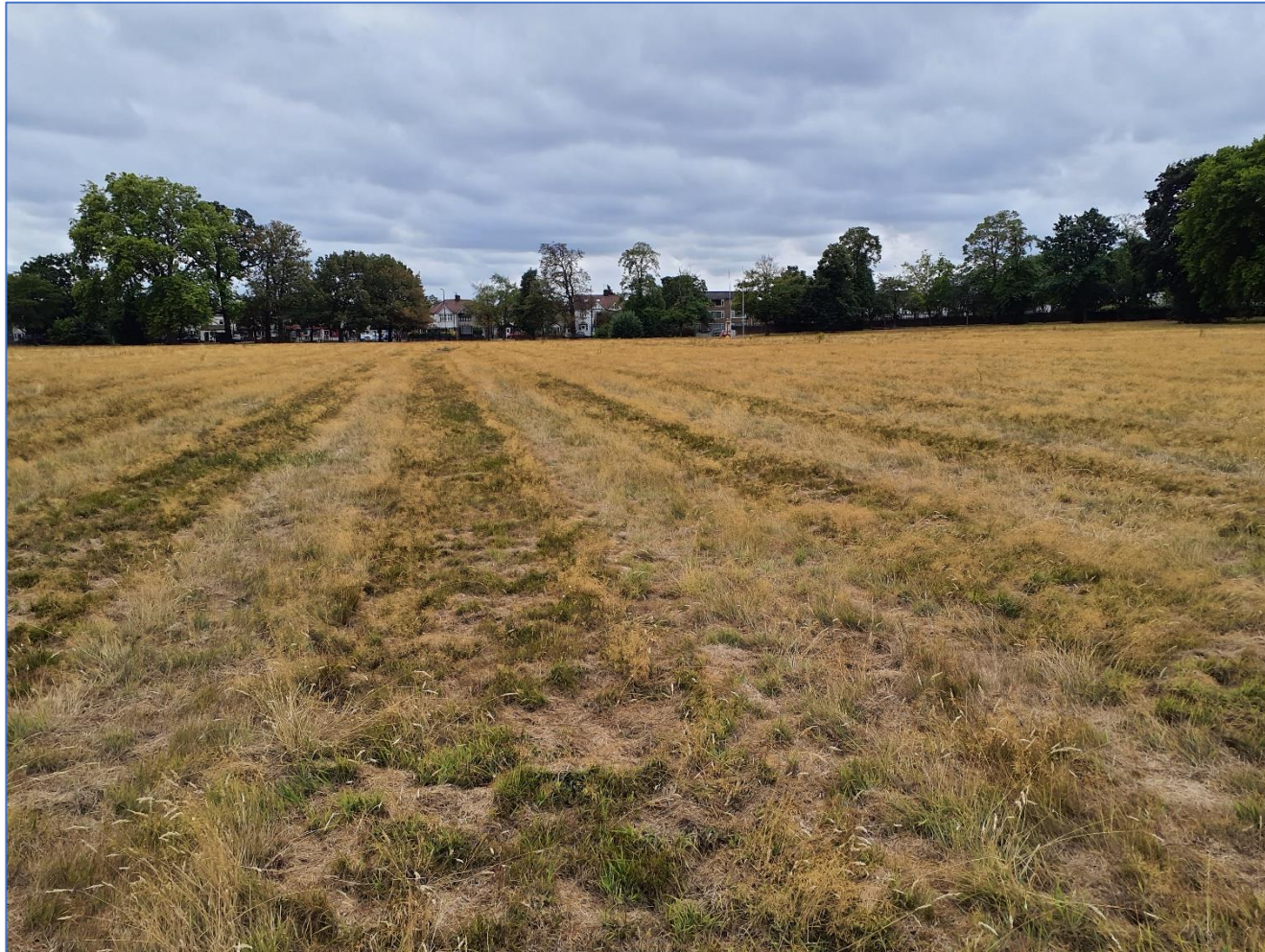
Figure 8: Kneller Hall - extensive acid grassland