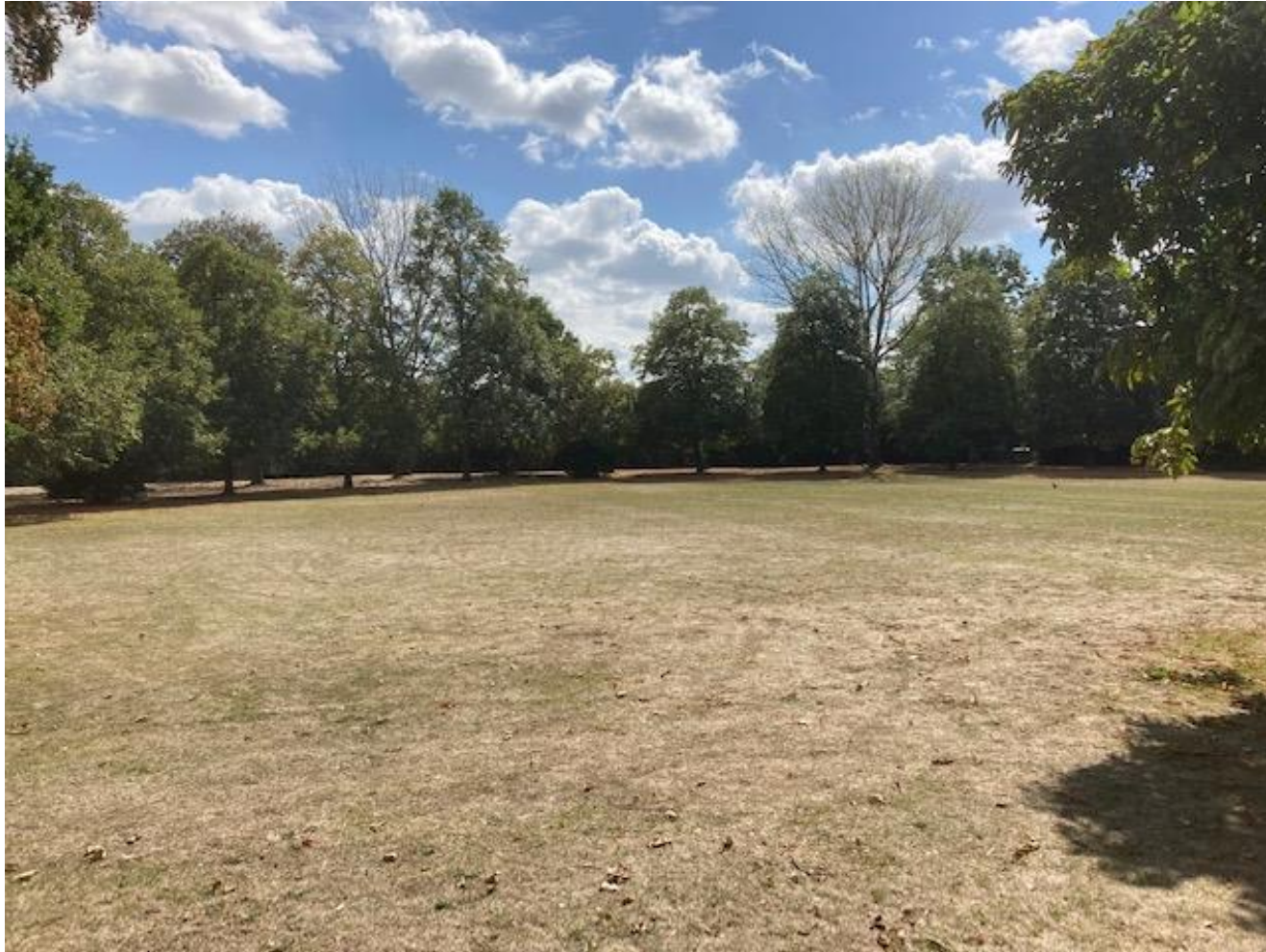
Figure 17: Nursery Green, Linear Walk and Partridge Green