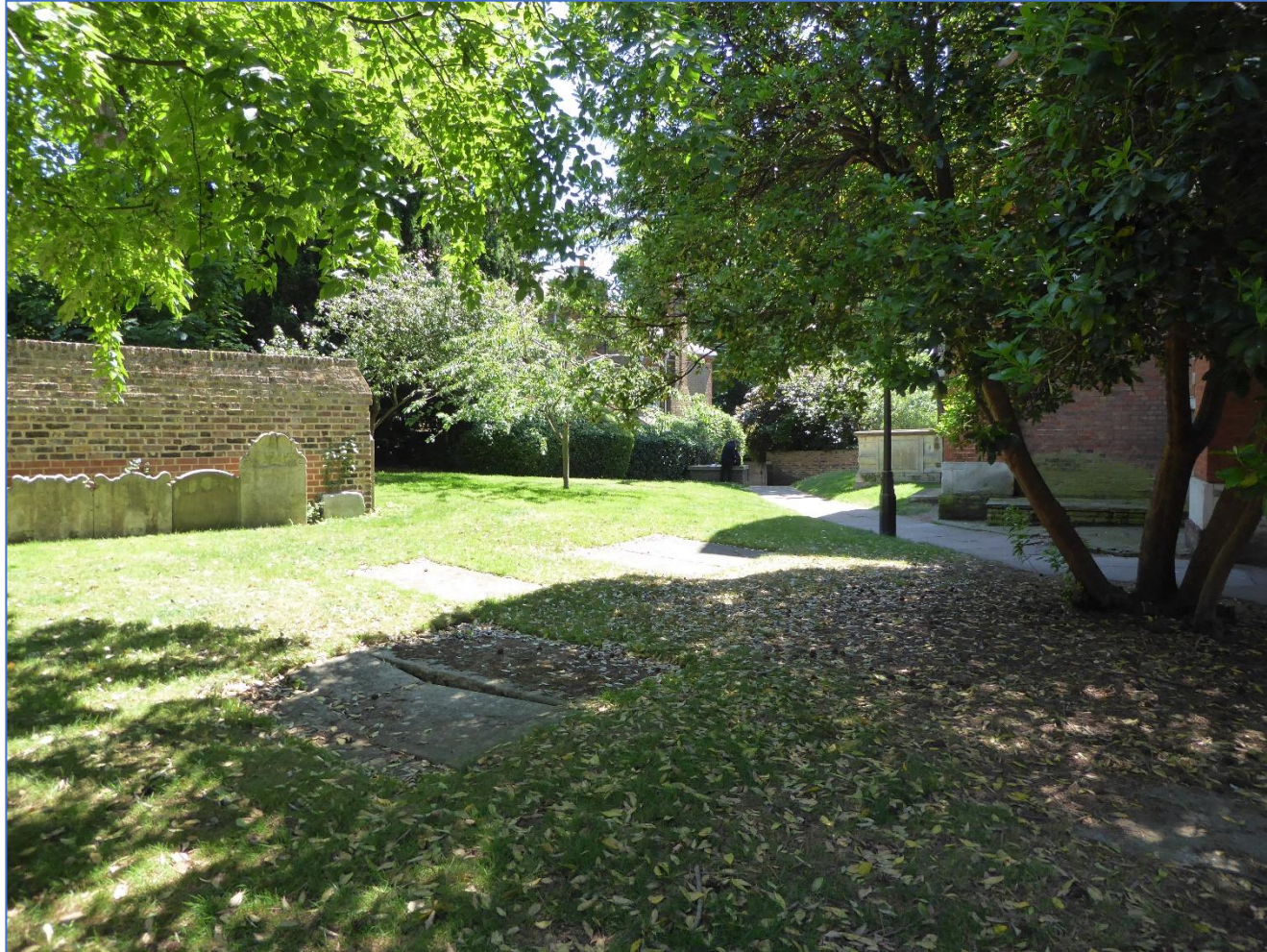
Figure 22: St Mary The Virgin Churchyard (Twickenham)