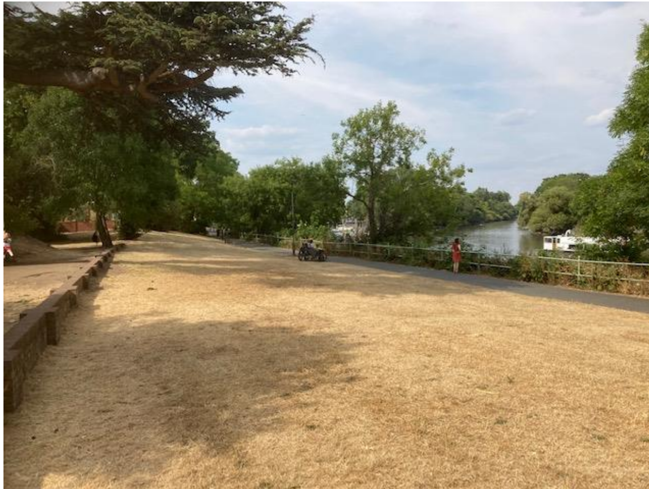
Figure 26: Isleworth Promenade