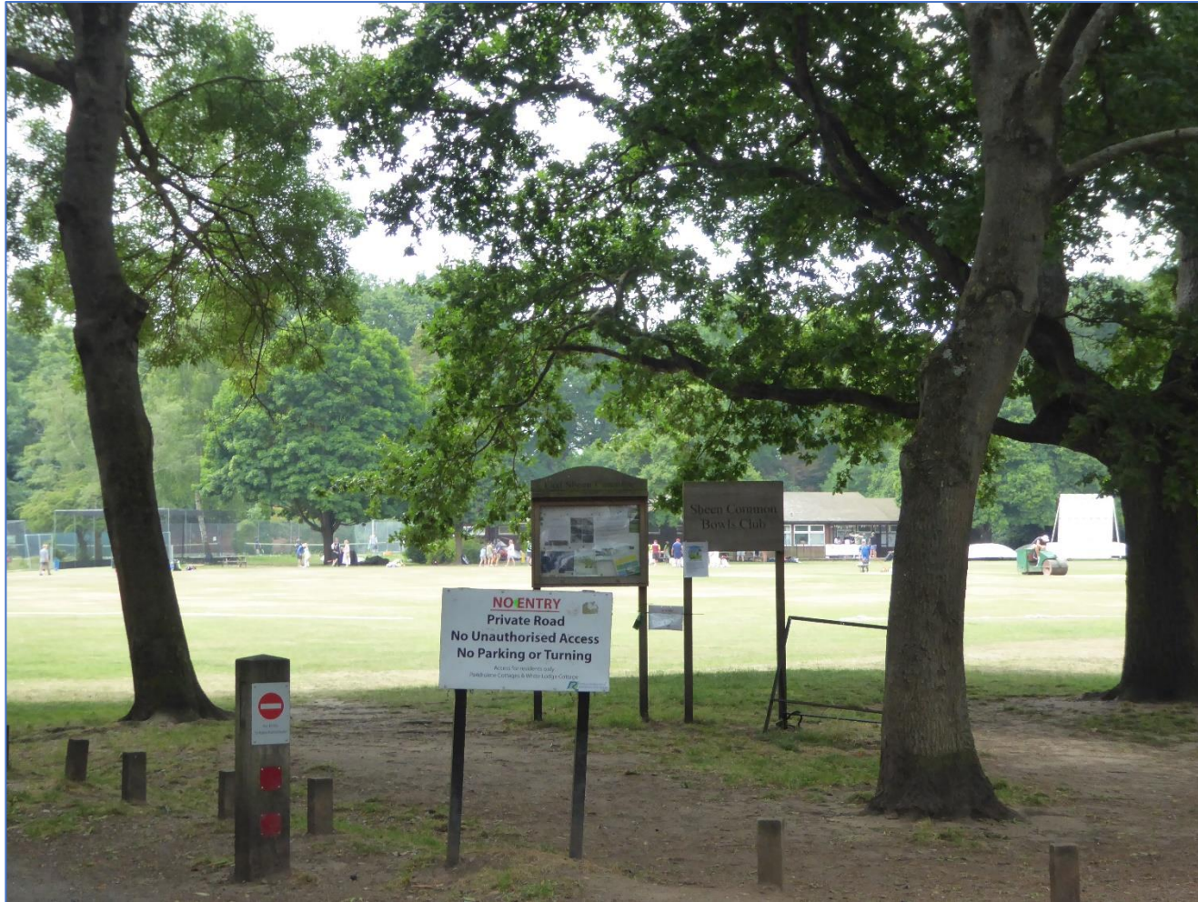
Figure 33: Part of Sheen Common