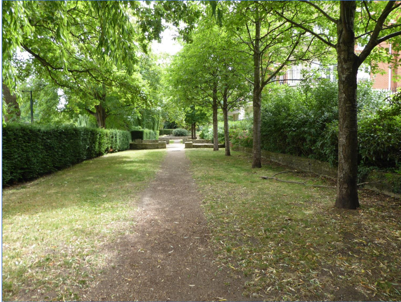
Figure 23: Cambridge and Warren Gardens