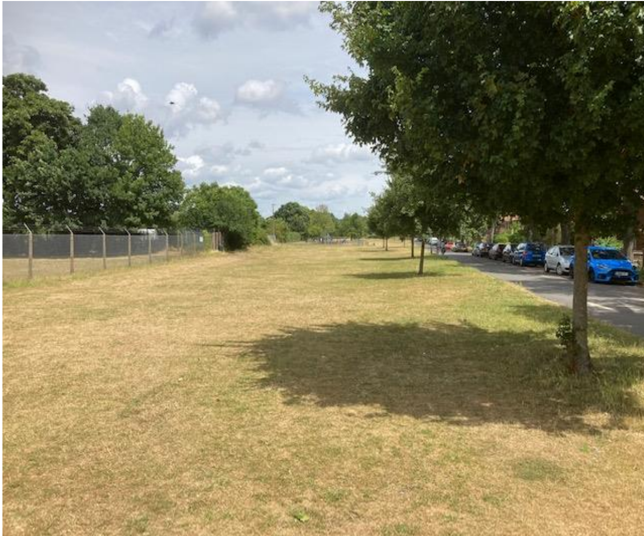
Figure 32: Riverside Drive Open Space