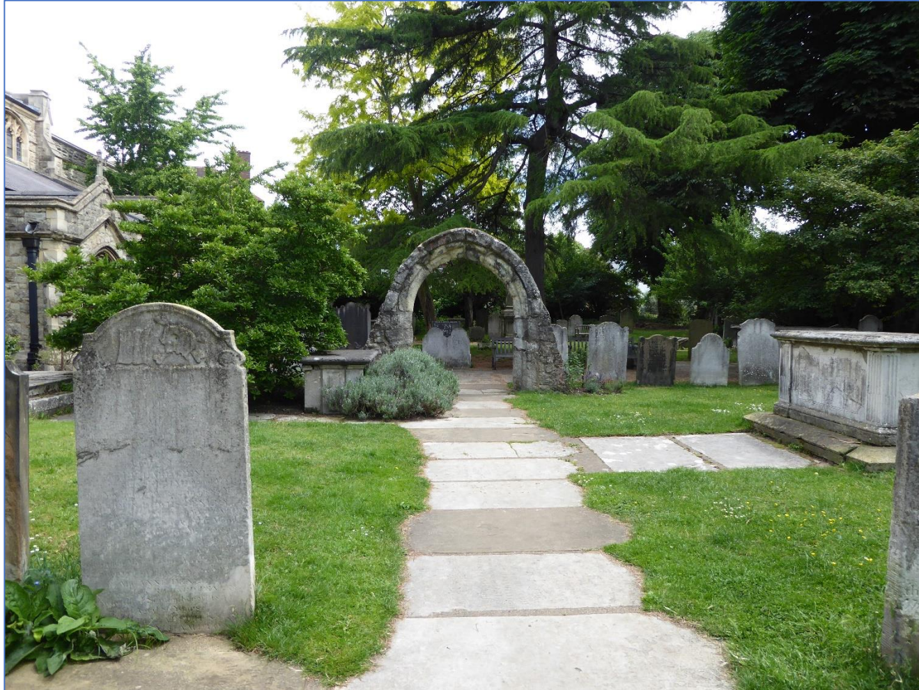
Figure 35: St Mary The Virgin (Mortlake)