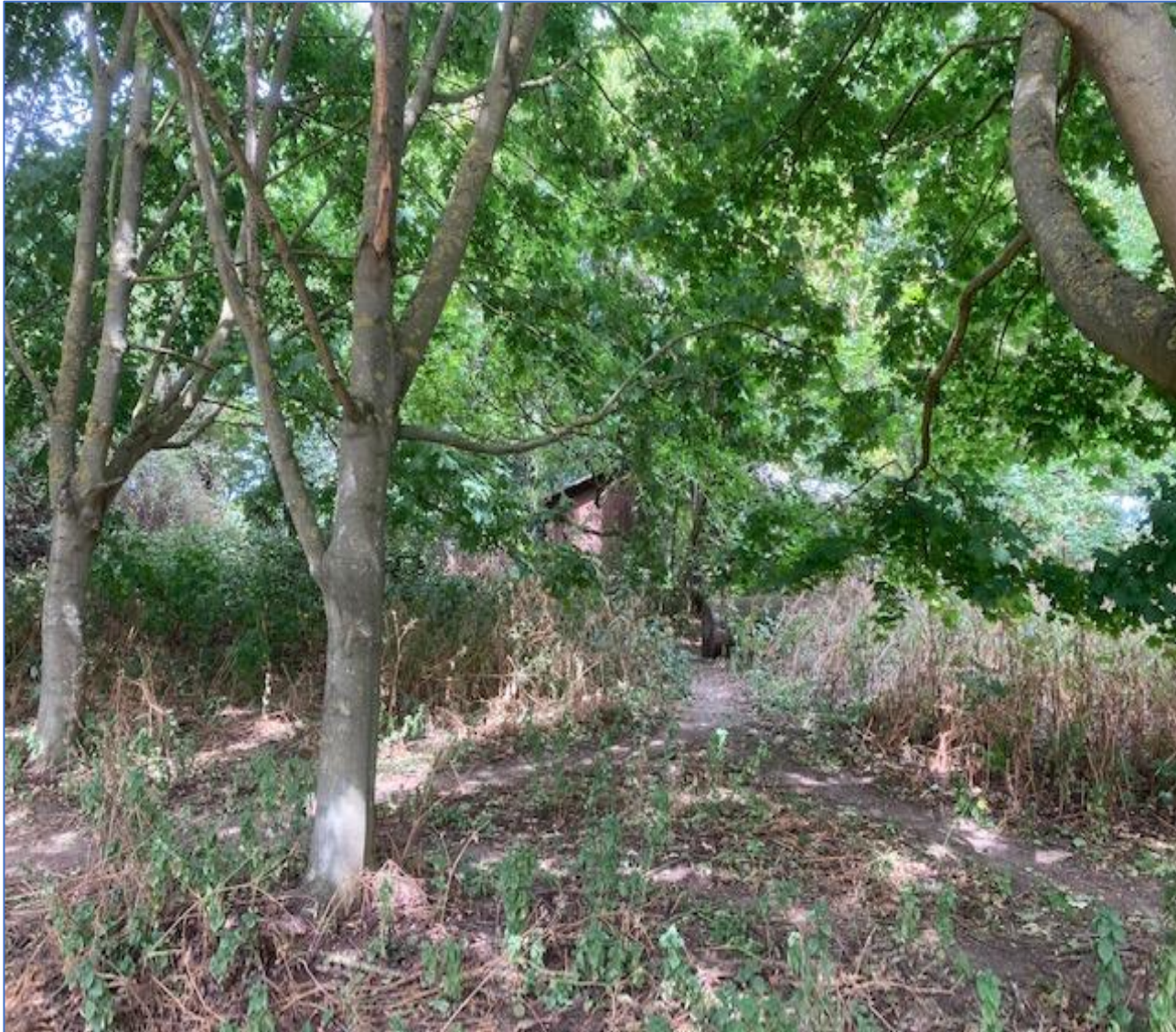
Figure 3: Barn Elms Riverside (Sports Centre Field by river only)