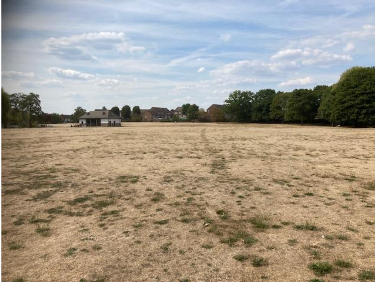
Figure 28: Kneller Gardens