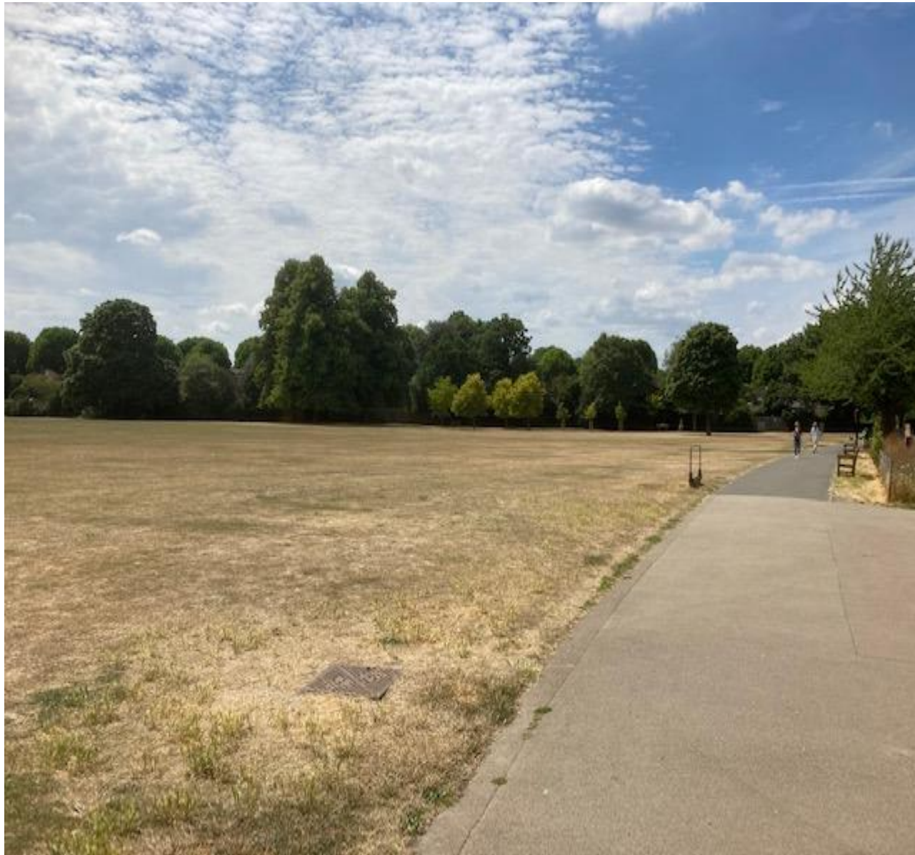
Figure 24: Carlisle Park