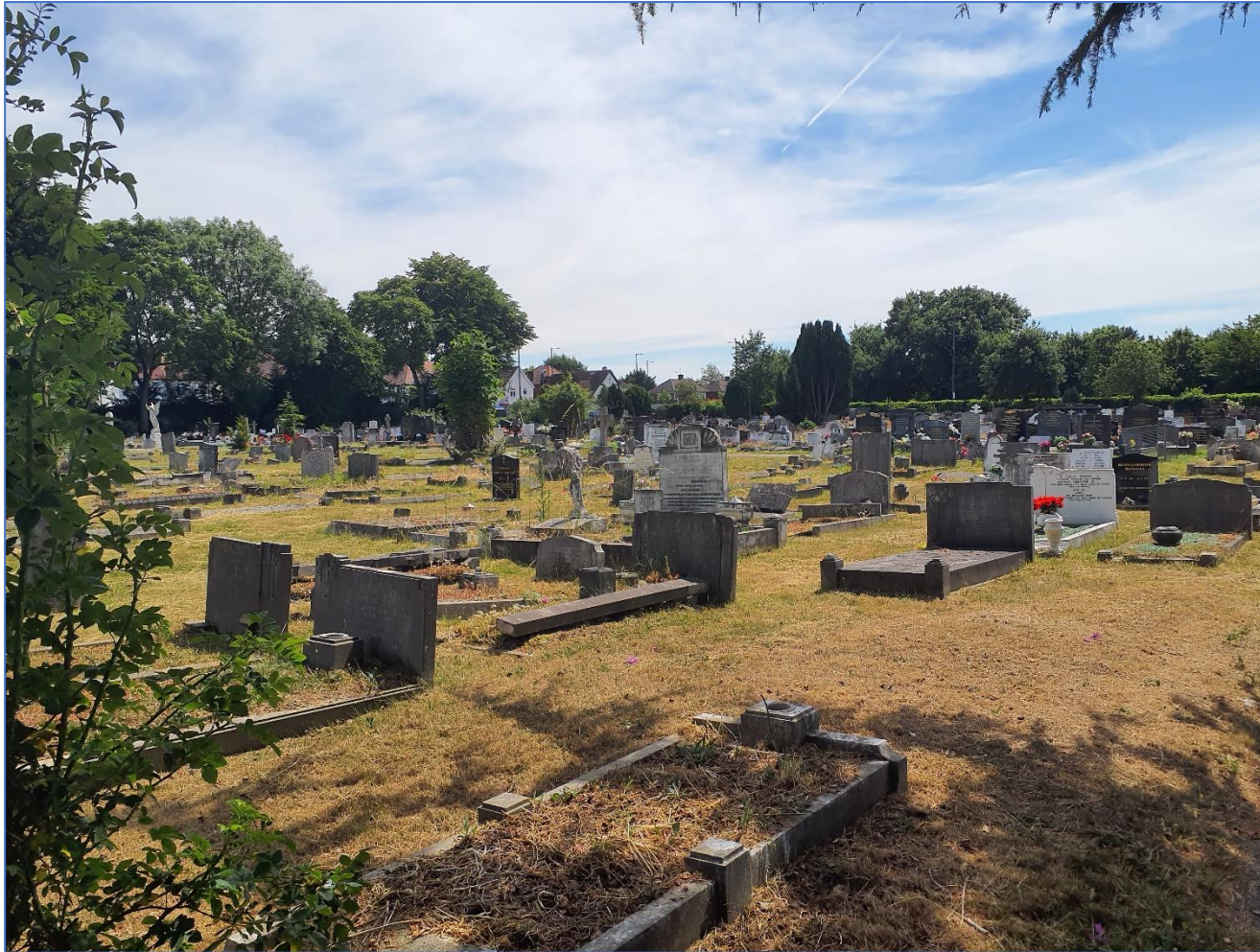
Figure 11: Hounslow Cemetery - extensive acid grassland