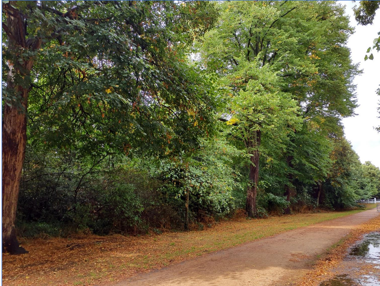
Figure 7: Grey Court School - woodland