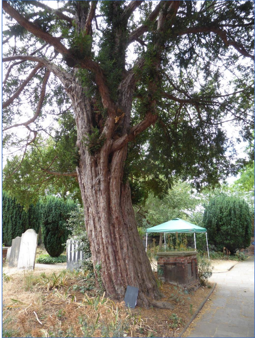
Figure 36: St Mary's Church (Barnes) - veteran yew tree