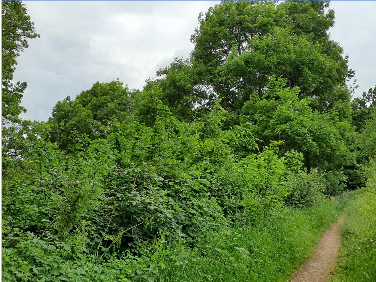
Figure 5: Petersham Common