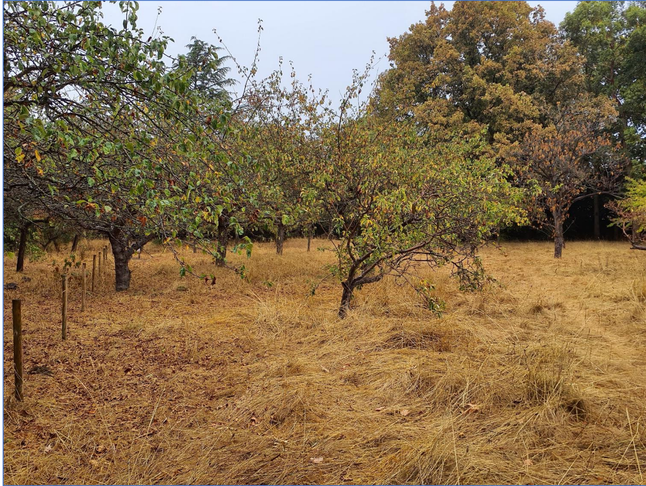
Figure 10: Orford House - orchard and neutral grassland