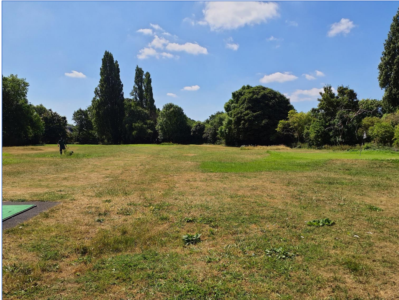
Figure 29: Palewell Pitch and Putt