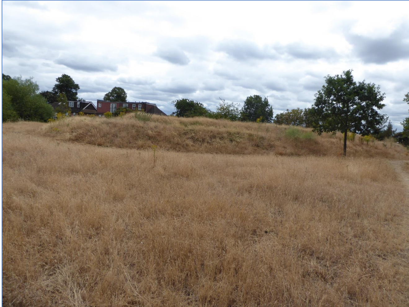
Figure 14: Challenge Court Open Space