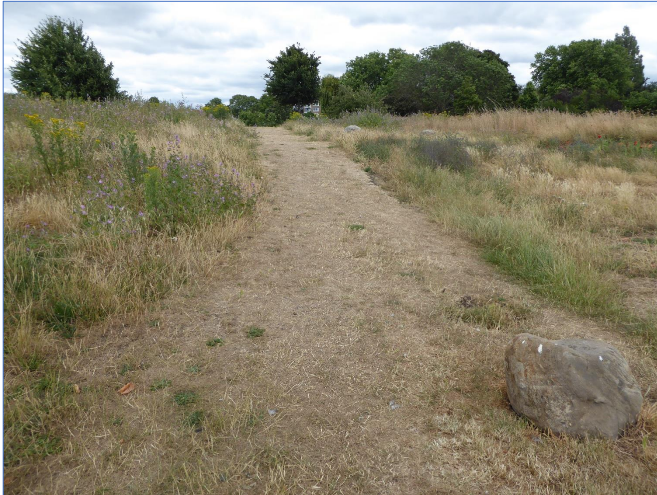
Figure 13: Broom Road Recreation Ground