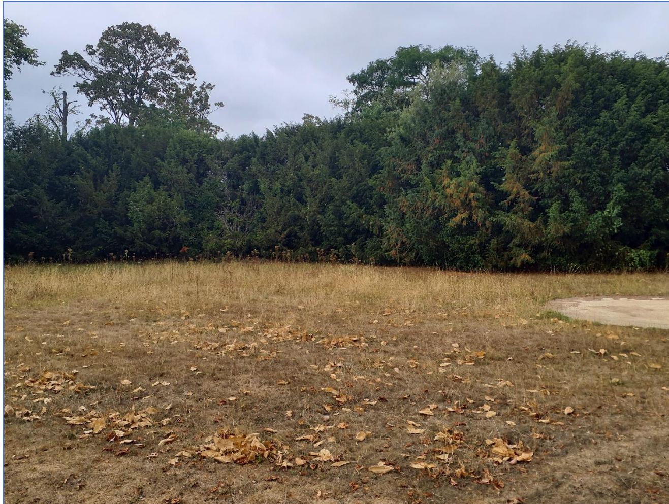
Figure 15: Hampton Court School - area of acid grassland