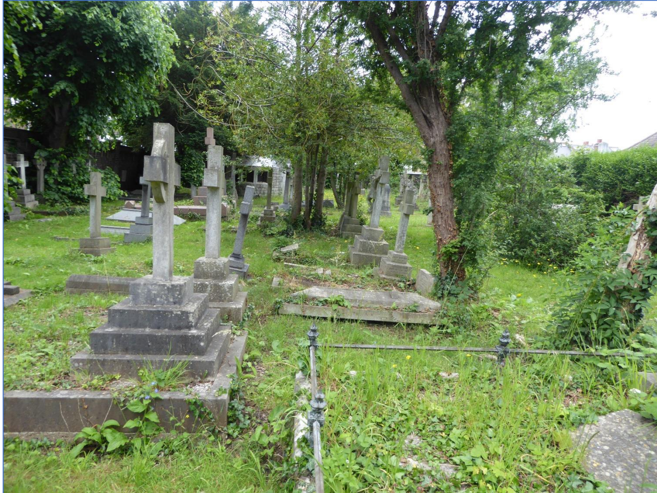
Figure 20: St Mary Magdalen RC Churchyard (Mortlake)