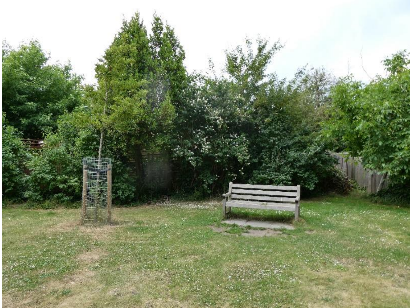
Figure 19: School House Lane Orchard