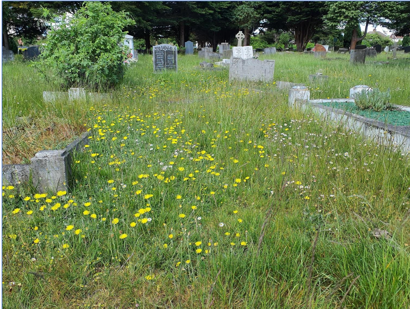
Figure 12: Borough Cemetery