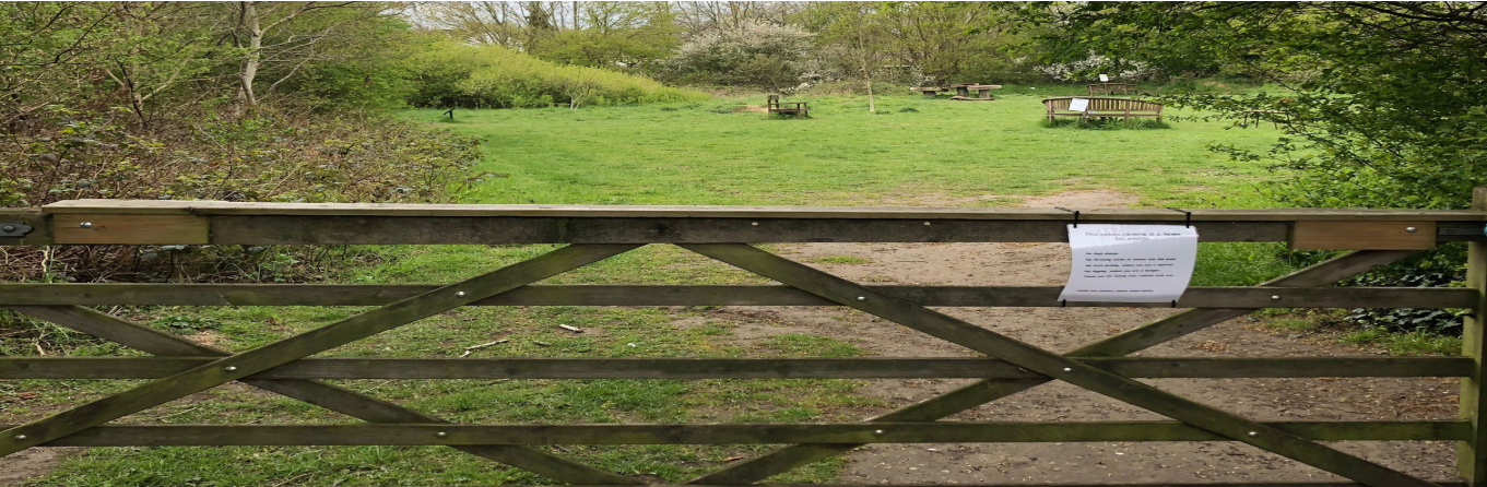
View southern of entrance to nature reserve