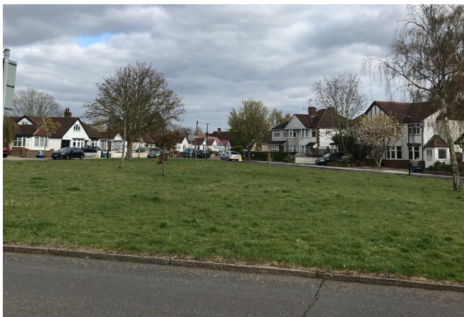
View southeast from Ellerman Avenue towards the western boundary