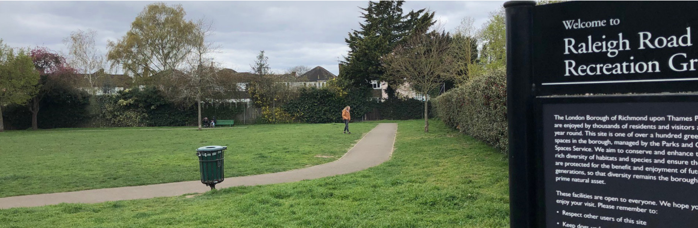
View east from southern boundary