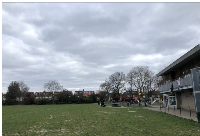
View east along southern boundary