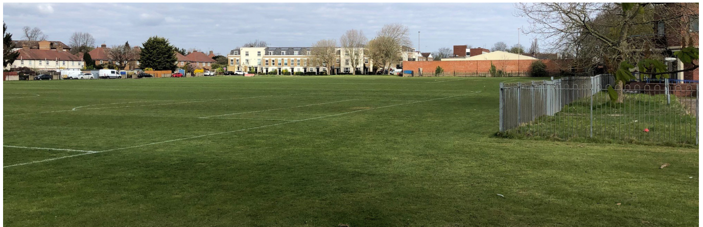
View north from southern boundary