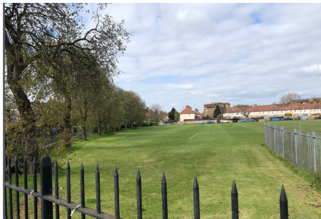
View west from eastern boundary