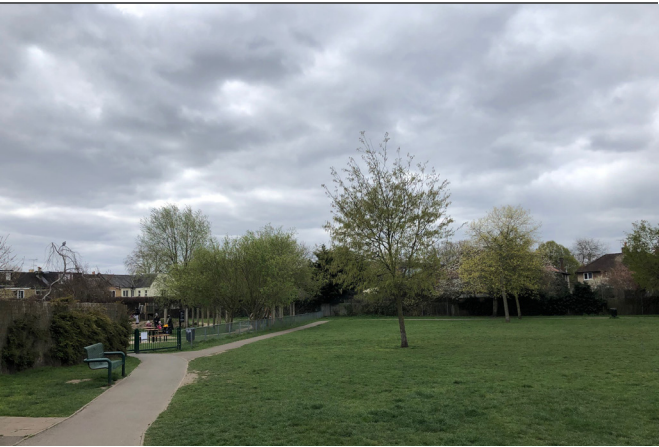
View north from southern boundary