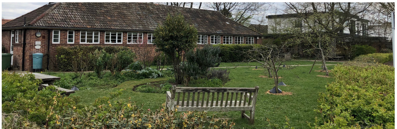
View east from northwestern tip