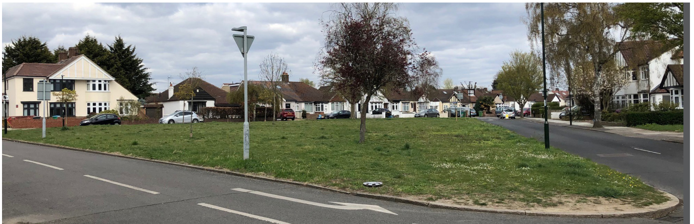
View north east towards site from south west corner of site on Ellerman Avenue