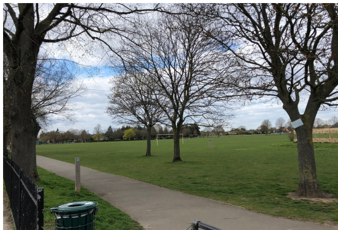
View north west from southern tip of site