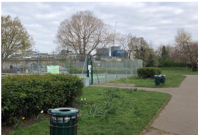
View north west from southern boundary