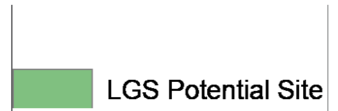
Potential LGS site map