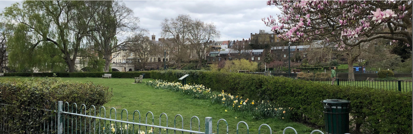
View north from Clevedon Road