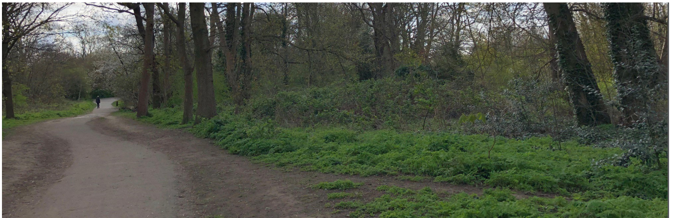
View east from western part of the site