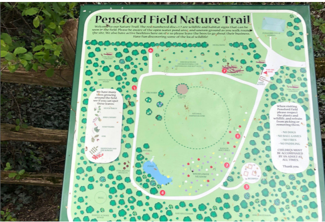
View of signage within site