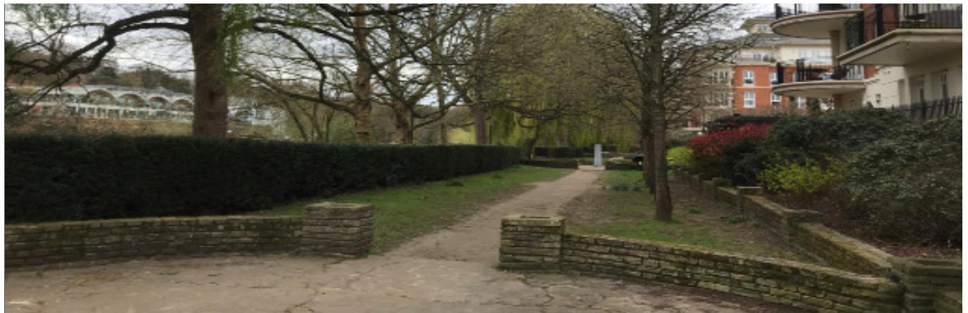
View southwards from the centre of the site in Warren Gardens