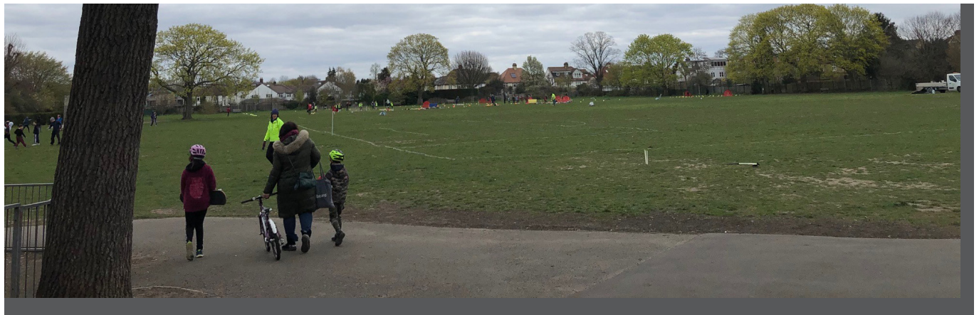
View north from southern boundary