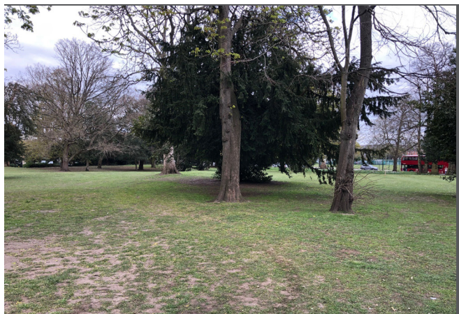
View east from western boundary