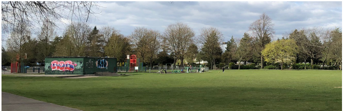
View along north western boundary