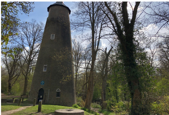
View south west of Shot Tower within the westernmost part of the site