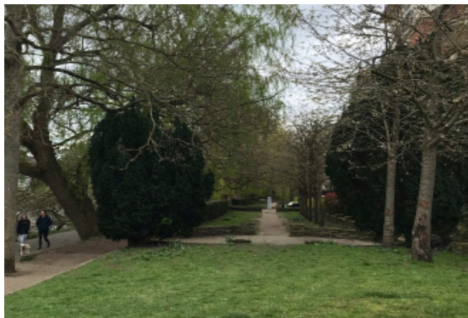
View southwards from northern boundary