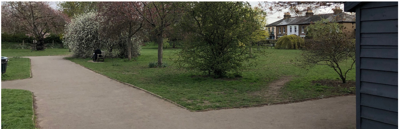
View northeast from southern boundary