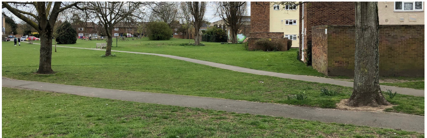
View south from northern boundary