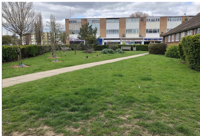
View north east from south west boundary