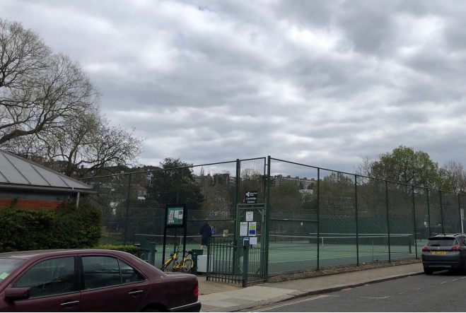
View east from Clevedon Road