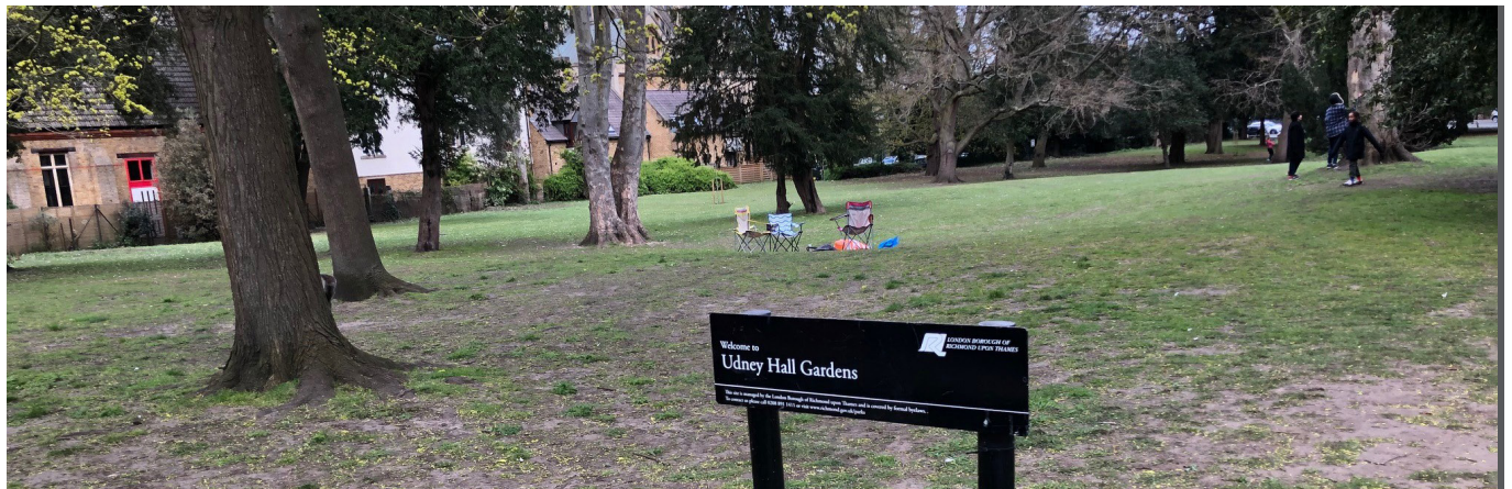
View north east from western boundary