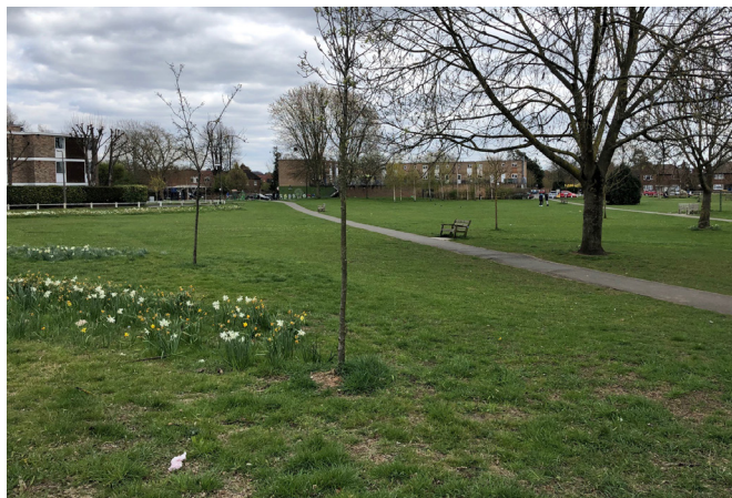
View south east from northern boundary