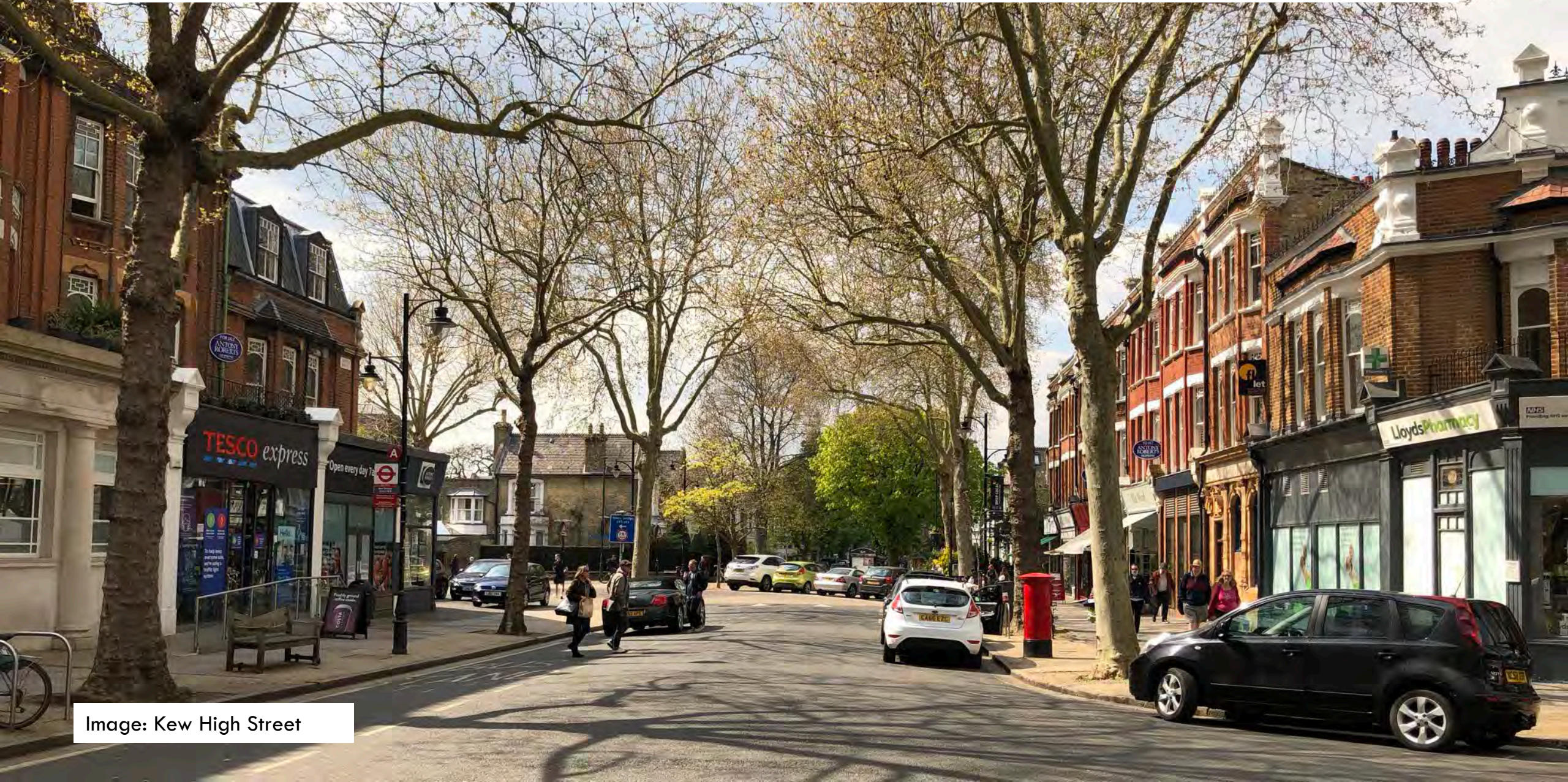
Image: Kew High Street