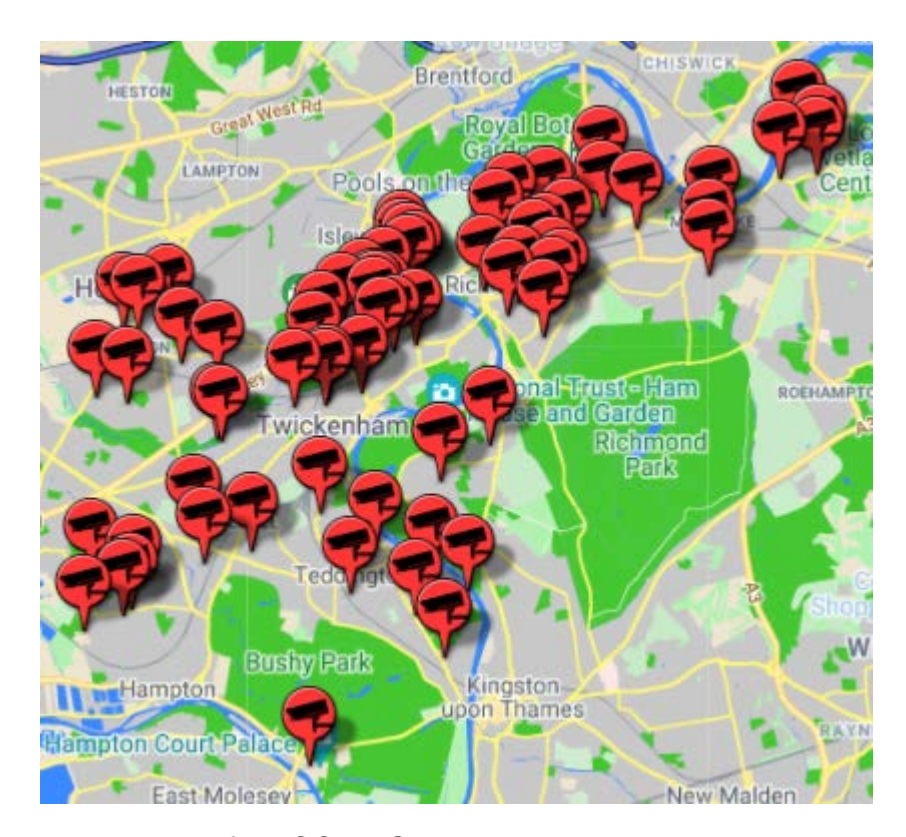
Distribution of 70 CCTV Group Members as per 27 July 2021