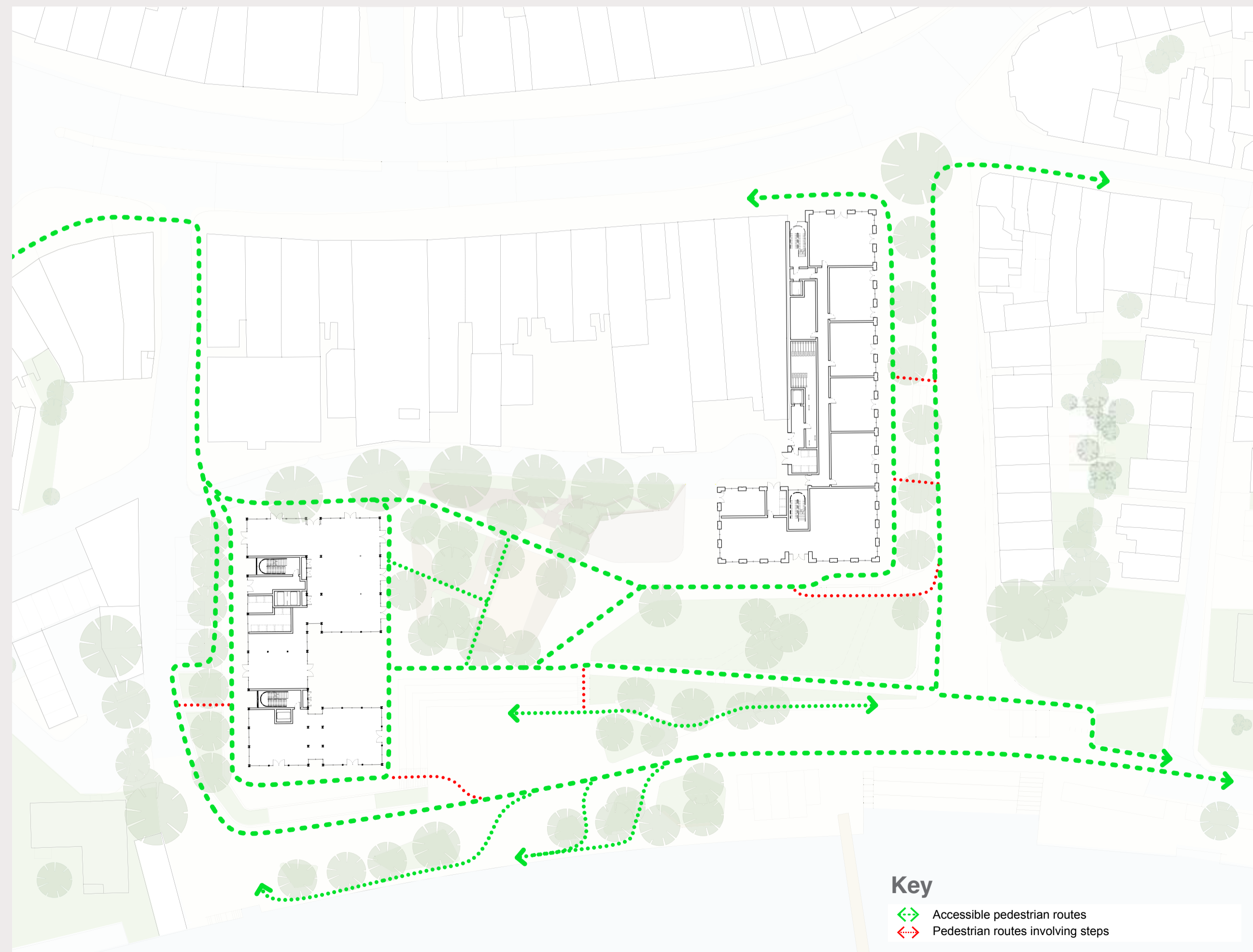
Pedestrian movement plan