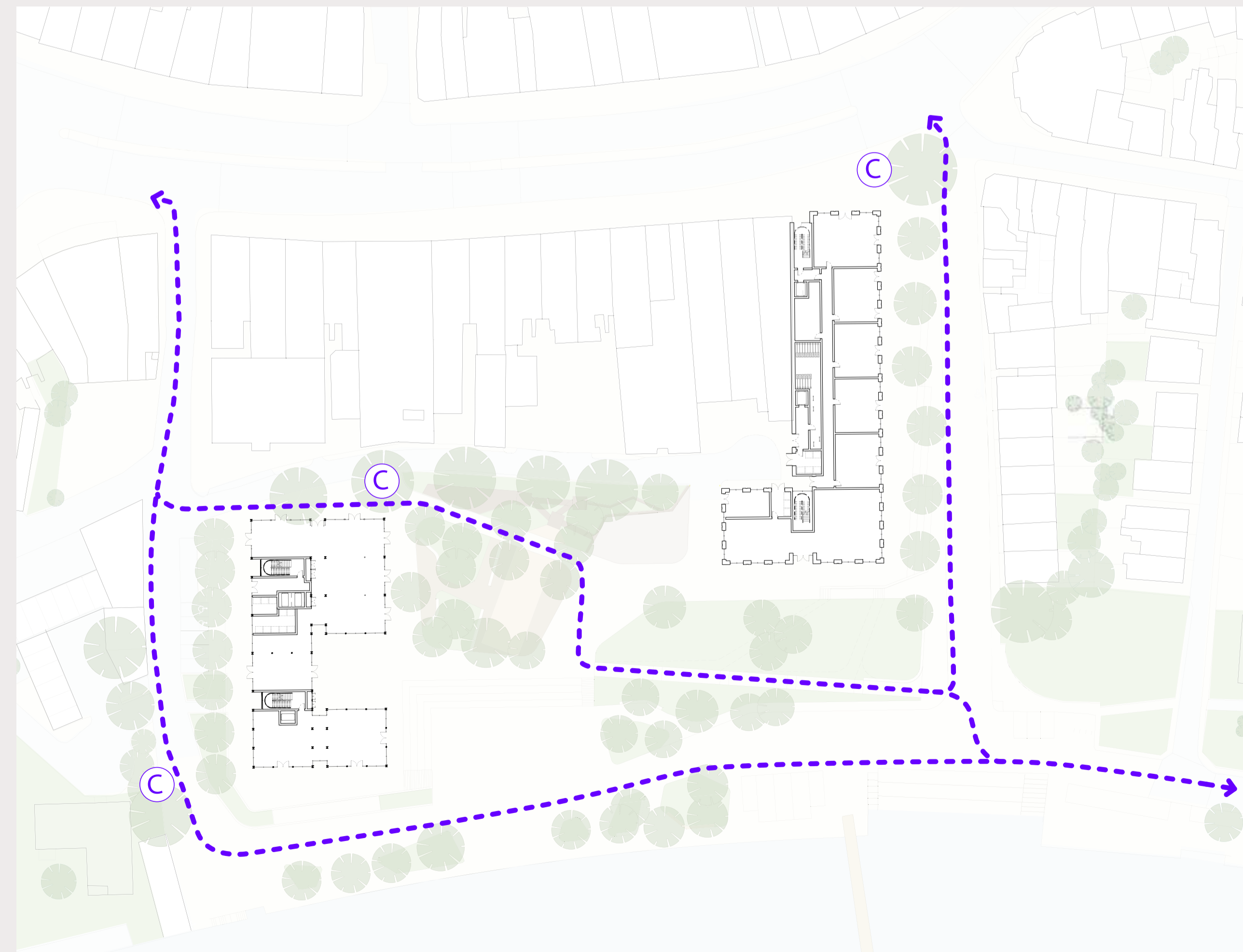
Cycle movement plan