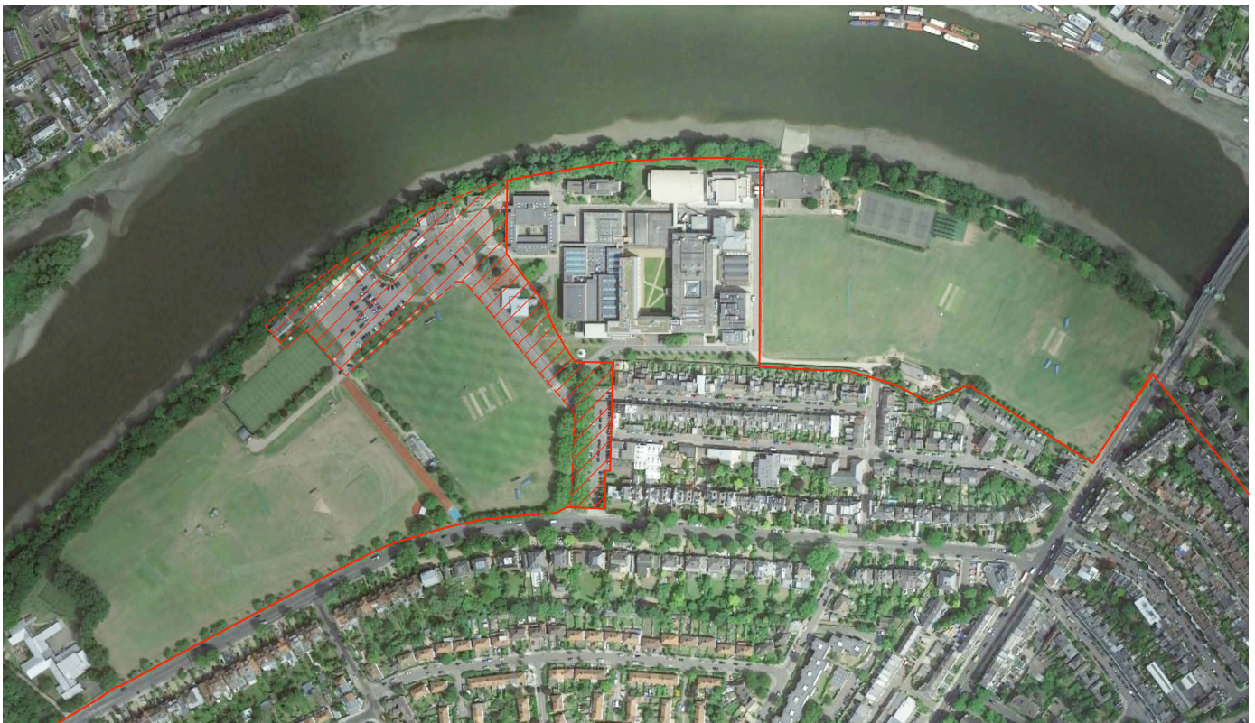
Aerial Image, NTS